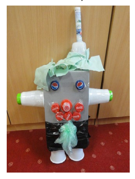
Illustration 1. Creative toy "Robot"

In a research study conducted under my supervision, Olga Staniszewska (2014), a student of kindergarten and primary school pedagogy, diagnosed children's abilities in a group task – they were supposed to make a creative toy. The aim for each two-person team was to construct, from available recycled materials, a creative toy that children in the same age would want to play with. The instruction stated: "In a moment I'll be giving you materials from which you will be constructing your own creative toy. I would like each toy to be unique and one of its kind. When working on it, please remember that every idea is good. Additionally, think about its use and a name for the toy." Each team received an identical set of materials consisting of: an empty cardboard shoe box, an empty water bottle, plastic corks, newspapers, a black plastic bag, disposable plastic cups, scotch tape, scissors.