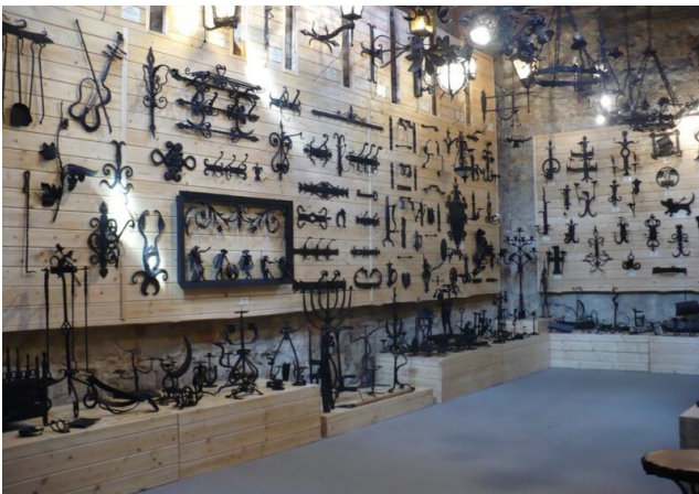
Photo 7 and 8. "Iron and Blacksmith Tradition Trail"