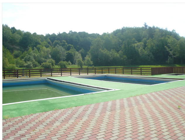
Photo 3 and 4. Sports-recreational complex “Nartsport”