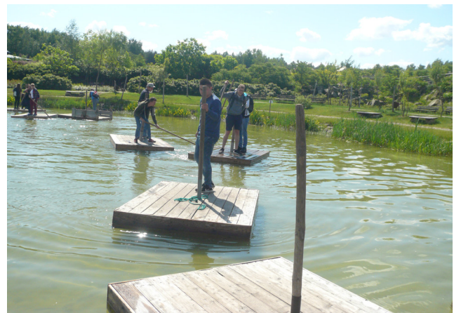
Photo 1 and 2. Thematic-sensory park “Magic Gardens”

“Nartsport” (Photo 3 and 4) is a sports-recreational complex founded by a private investor. It was constructed in 1993 as the first ski lift in the Lublin Region, due to a very high demand for winter sports infrastructure. In the following years the offer was gradually expanded. Currently, in the winter season the product offers a skiing-snowboarding and sledging slope as well as equipment rental. In the summer season the offer covers