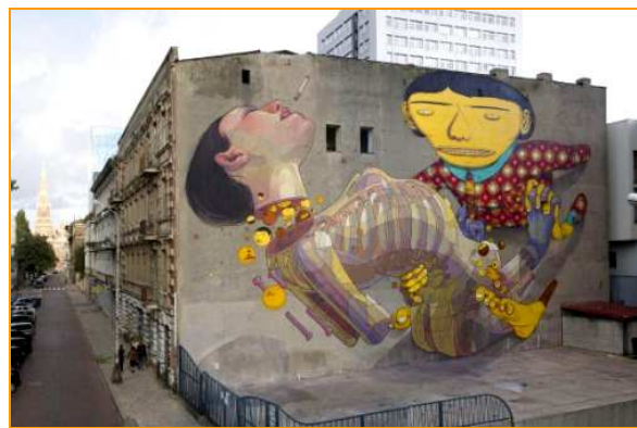
Photo 5. Mural at 5 Roosevelta St, Łódź