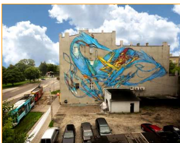
Photo 8. Mural at 82 Wojska Polskiego St, Łódź