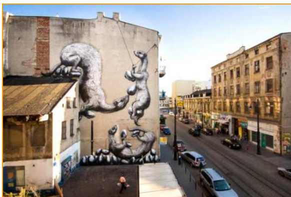
Photo 4. Mural at 5 Nowomiejska St, Łódź

Another group of murals is situated away from the city centre, but close to significant tourism assets (thus also in the tourism space of Łódź). An example is the mural in 82 Wojska Polskiego St (Photo 8), which is situated in a former Łódź Ghetto area, close to the Jewish Cemetery in Bracka St, Survivors Park and a museum exhibition about the ‘gypsy camp’ in the Łódź Ghetto. Therefore it can be stated that although the tenement house is located in a neglected part of the city, the appearance of the mural has raised its aesthetic value, rank and prestige and has thus enriched tourism space.