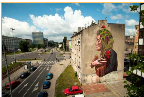
Photo 10. Mural at 16 Politechniki St, Łódź