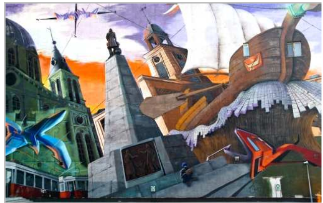
Photo 3. Mural at 152 Piotrkowska St, Łódź

The opening of the Museum of Art in the 'Manufaktura' shopping mall in 2008 marked a new beginning for murals in Łódź and the first city tour of the murals in Łódź was organized. Interest in street art was gradually increasing. Amateur artists began to be recognized and gained an increasing audience. The allegory of the city on 152 Piotrkowska St created by Design Futura Group in 2001 was the first large scale street art project in Łódź although significantly differing from the other murals created at that time (Photo 3).