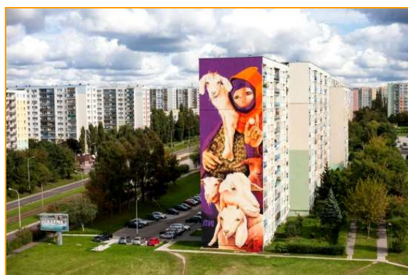
Photo 11. Mural at 80 Wyszyńskiego, Łódź

An interesting example of the creation of a new, attractive place in Łódź by an accumulation of murals is 3 & 12 Uniwersytecka St (Photo 9) and the mural in 59 Jaracza St situated close by. According to the opinion of local residents they are identified with each other and often mentioned together.