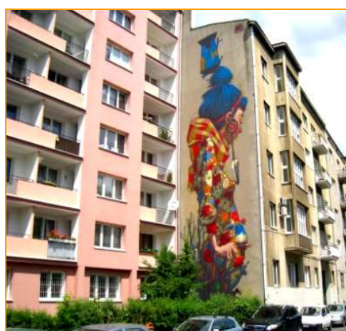
Photo 9. Mural at 12 Uniwersytecka St, Łódź