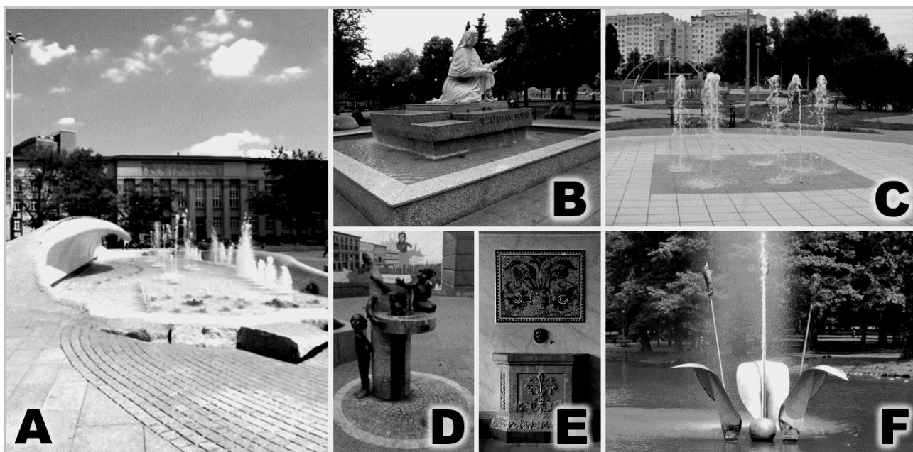
Fig. 1. Types of fountain in Łódź – descriptions in text