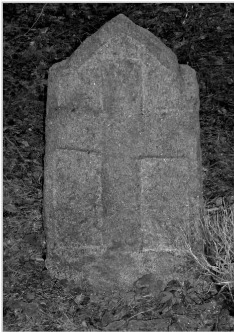
Photo 1. A stone gravestone without inscriptions in the disused Lutheran cemetery in the village of Kocioł Duży (Pisz Forest Division)

The highest total score was obtained by Lutheran cemeteries in Ruciane-Nida (15 points), Cudnochy (no 2) and Śwignajno (13 points each), Ukta (11), Karwica (9), Łuknajno, Lisunie, and Karp (8 each) (DŁUGO-ZIMA, DYMITRYSZYN & WINIARSKA 2012).