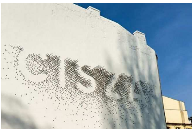
Photo 6. A mural / installation created from nails on the wall of a tenement house by Łukasz Berger (Poland)