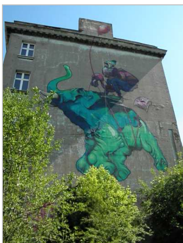
Author: Etam Crew (Poland)