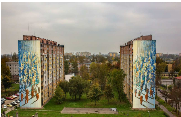
Photo 4. Murals painted outside the centre of Łódź on walls of multi-family buildings – author: PROEMBRION/ CHAZME/CEKAS/TONE/SEPE (Poland)

from 1300 huge nails, weighing over half a tonne, inscribed 'Silence' (Photo 6). The third impressive installation presents a bird (a swift) created by a Portuguese artist, Artur Bordalo (known as Bordalo II), from recycling materials and colourful paints (Photo 7). Mural themes vary, and it is difficult to indicate predominant motifs, but several artists referred to the city where they were working. One such work is one of the first murals, entitled 'Łódka' (Boat) (Photo 1), situated on the main street of the city at 152 Piotrkowska St. It was created in 2001. The work covers about 960 m 2 and at the time was the largest mural in the world. It is an interesting fact that the artist used 2000 spray cans ( www.lodz.wyborcza.pl , www.expressilustrowany.pl , www.murale.mnc.pl ). The second work was a postcard-like mural, created by