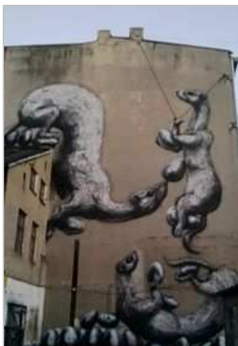
Author: Roa (Belgium)

The purpose of the inventory was to indicate the precise location of murals, as well as gather photographic documentation. In order to find out what the participants of the tours organized in 2014 by the Urban Forms Gallery thought about Łódź murals, a questionnaire was distributed evaluating the tours. The research was continued throughout 2014. The questionnaire was usually handed in towards the end of the tour, when the participants had already formed their opinions. They filled out the questionnaires conscientiously, most willingly answered the questions, and only a few refused to take part in the study. Answers were given by 762 respondents (78% of all tour participants). The first part of the questionnaire included filtering questions e.g. "are you an inhabitant other tourist attractions are you planning to visit during your stay in Łódź?" The other part of the questionnaire was answered by all respondents. They