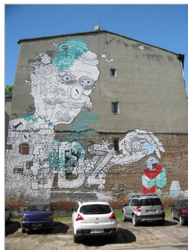
Author: Gregor (Poland)