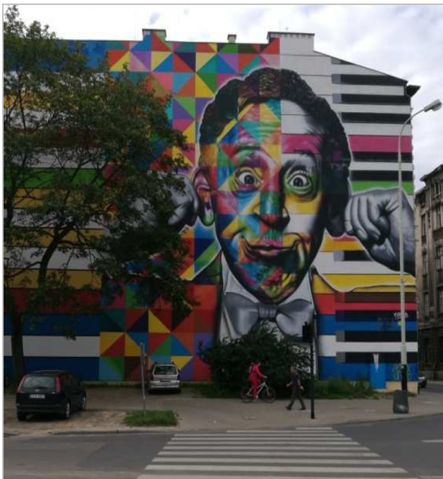
Photo 9. A large-format mural presenting a Łódź-born pianist, Artur Rubinstein by Kobra (Brazil)

graffiti artists from a New York group, called Tats Cru, which was painted on a surface of 733 m 2 , during the 10 th International Festival of Graffiti Art – Outline Colour Festival , held in Łódź in 2010, (Photo 8).