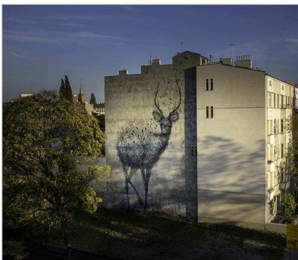
Author: Daleast (Chiny)