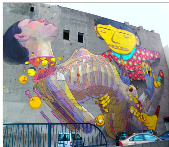
Photo 10. A Housing Estate – Os Gemeos (Brazil) and Aryz (Spain)