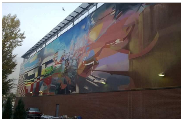
Photo 5. Murals painted in the centre of Łódź on the end wall of a shopping centre