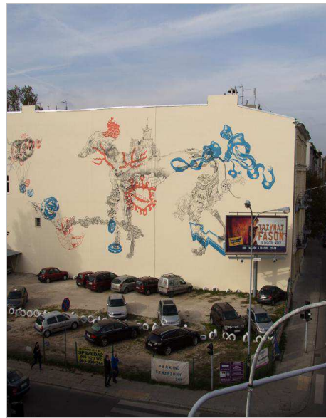
Author: Gregor (Polska) Source: http://www.galeriaurbanforms.org