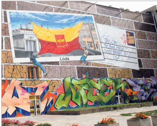
Photo 8. One of the first large-format murals in Łódź, created by graffiti artists from the New York Tats Cru group

graffiti artists from a New York group, called Tats Cru, which was painted on a surface of 733 m 2 , during the 10 th International Festival of Graffiti Art – Outline Colour Festival , held in Łódź in 2010, (Photo 8).