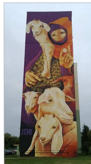
Author: Inti (Chile)