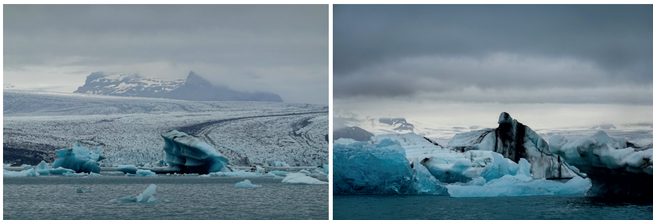
Figure 5. Photographs of Large Glacier Lake, Jökulsárlón, in July 2022