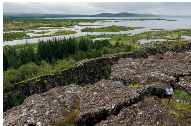
Figure 4. Icelandic lake in July 2022