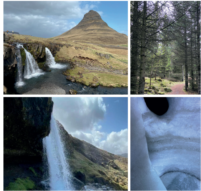
Figure 2. Photographs of pristine mountain, serene forest, a waterfall and a snow cave in Iceland in May 2023

The study identified the top ten natural landscape types in Iceland. These were glacial lakes, the Blue Lagoon, ice caves, serene forests, peaceful rivers, auroras, mountains, wildflower fields, waterfalls, and cliffs and coastal formations. From each category, the four highest-ranking images were chosen, resulting in a curated collection of forty photographs for the healing Icelandic landscape album. Some examples of the pictures are shown in Figure 2, Figure 3, Figure 4, Figure 5 and Figure 6.