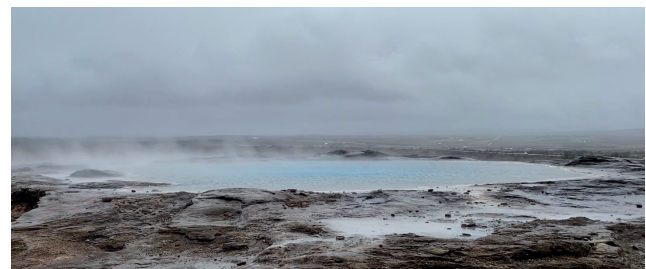
Figure 3. Photographs of a waterfall, pristine black sand beach and geothermal lake in Iceland in May 2023