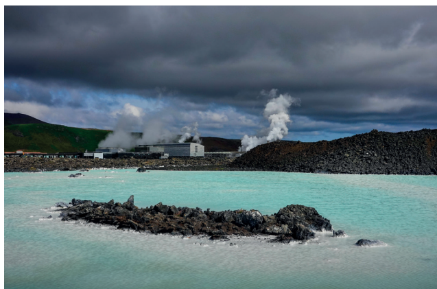
Figure 6. The Blue Lagoon in July 2022