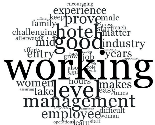
Figure 2. Work experiences of women hotel employees

The thematic analysis along with the generation of codes was based on the transcripts of interviews and analysed using Computer Assisted Qualitative Data Analysis Software (CAQDAS) NVivo (Release 1.0). The researchers checked for equivalence and differences while forming codes (Creswell, 2007) and checked the coded data to verify the logical pattern (Egberg Thyme et al., 2013). Four main themes and twenty-three sub-themes emerged from the transcript analysis that broadly summarise the workplace experiences and career advancement prospects for women in the Indian hotel industry. Table 2 presents the details of the thematic analysis. Within the findings of the study, quotes from the participants are included as evidence (inductive analysis) and the findings are further supported by the extant literature (deductive analysis) (Gummesson, 2000). Further, ‘word clouds’ were generated by means of synonym-selection of the word frequency selection furnished in NVivo (Figures 2 and 3).