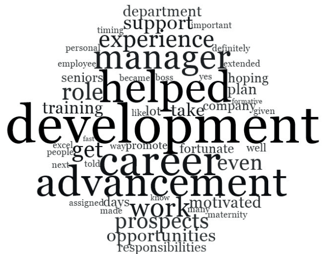
Figure 3. Career advancement prospects of women hotel employees