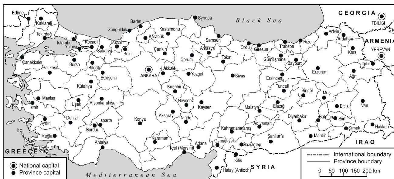
Figure 2. Administrative division of Türkiye

The Mevlana Mausoleum , which contains the tomb of Jalaladdin Rumi (1207–1273) , has a great influence on the religiosity of the people of both the city and the Province of Konya. He was the Islamic theologian and Persian mystic who founded the Order of Dancing Dervishes . He is also regarded as one of the most famous and celebrated Sunni poets. For this reason, Konya is an important religious centre in Türkiye, to which many pilgrimages are made. The city also hosts an annual festival dedicated to Mevlana (Sakar, 2022) while in 2016 the city was proclaimed the capital of Islam.