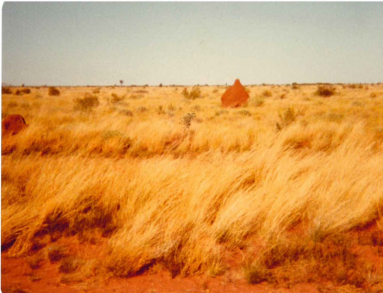
Fig. 4. View from my Toyota 4WD troop carrier on the rough bush track on the almost 700 kilometre single vehicle width “road” between Lajamanu and Katherine, c.1982.