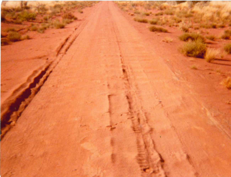
Fig. 3. View from my Toyota 4WD troop carrier on the rough bush track, close to Lajamanu, c. 1982.