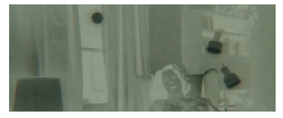
Fig. 4. Jack's victim.