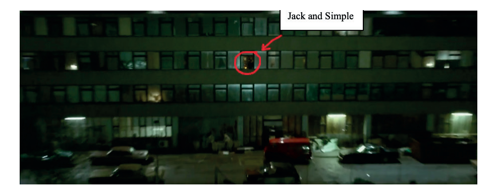
Fig. 1. Jack and Simple.<sup>1</sup>

Jack and Simple are not in some desolate area. On the contrary, they are inside an apartment building with many other inhabitants and cars parked outside: