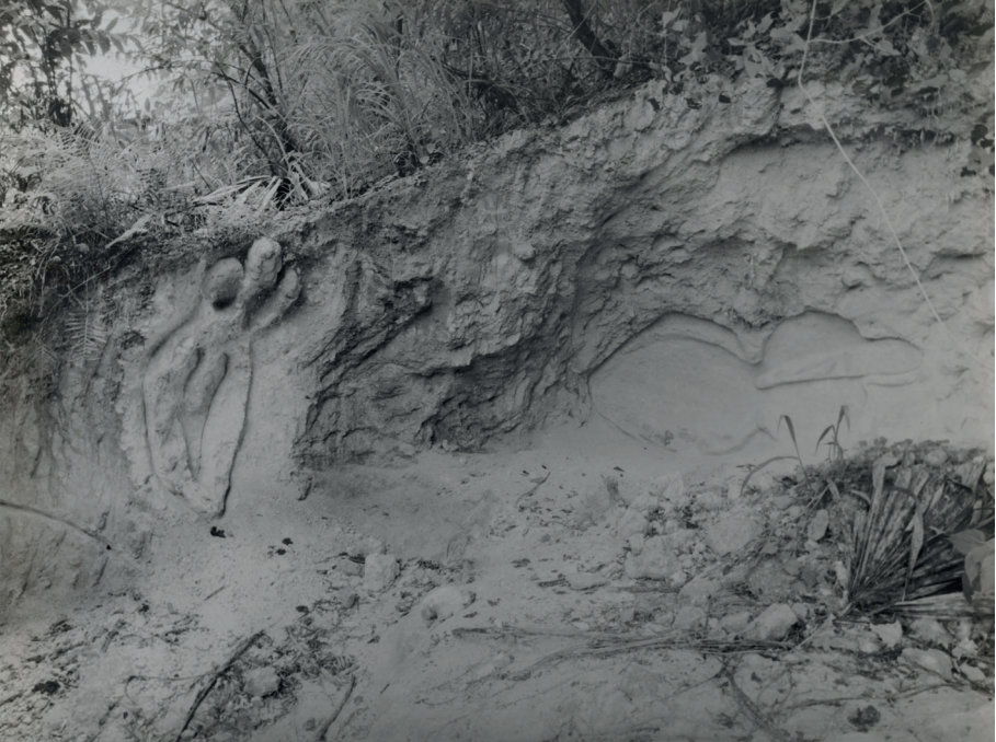
Fig. 2. Ana Mendieta, Guanaroca & Iyaré , 1981. Gelatin silver print, 7 1/4 x 9 5/8 inches.

The idea of communication, exchange, or what some call semiosis runs throughout Mendieta's work. In fact, she has described her work as an ongoing "dialogue between the landscape and the female body" (qtd. in Viso, Unseen Mendieta 109). This suggests that Mendieta didn't just see herself as working in the landscape but working with the landscape, perhaps