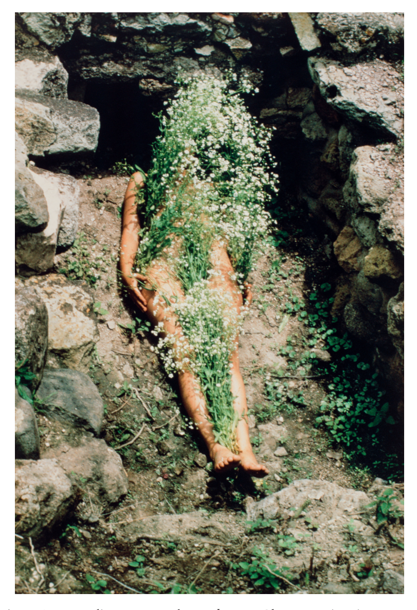
Fig. 1. Ana Mendieta, Imagen de Yagul , 1973. Chromogenic print, 20 x 13 3/8 inches.

In this work, Mendieta represents what she would later call a "total identification with nature." The land, the flowers, and herself have molded into one and this is a stark contrast, and antidote perhaps, to works like Agricola's, Heizer's, and Smithson's. While all four artists represent