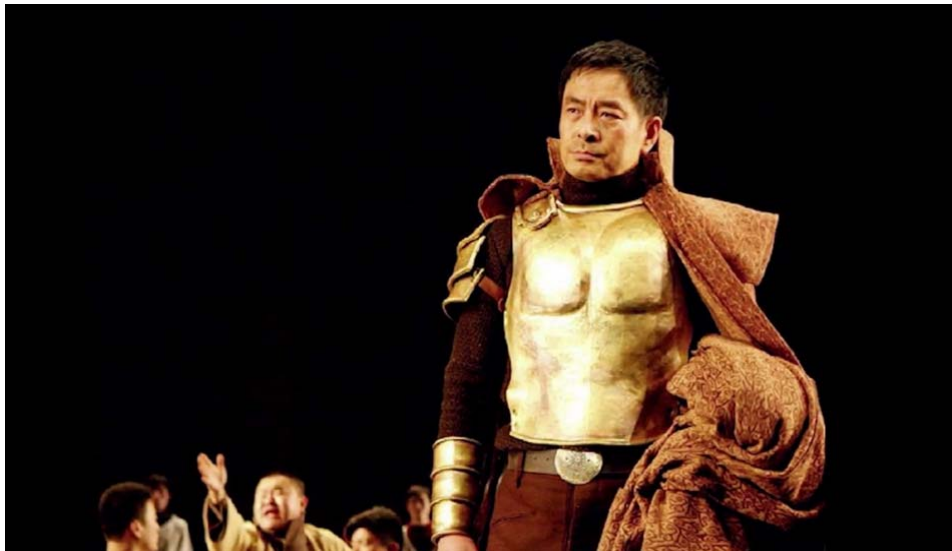
Actor Pu Cunxin as Coriolanus from 'Chinese Coriolanus at Edinburgh Festival' Embedded still