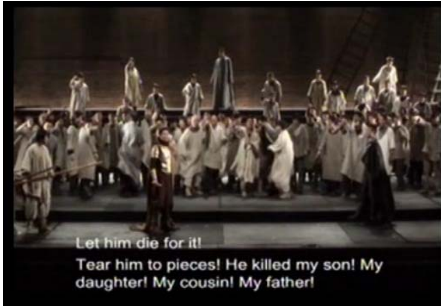
Migrant workers as the citizens confront Pu Cunxin as Coriolanus from the 2007 production at the Beijing People's Art Theatre 'Coriolanus'