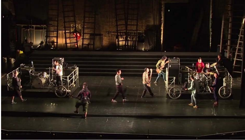
Beijing bands Suffocated and Miserable Faith in rehearsal in Edinburgh from 'Chinese Coriolanus at Edinburgh Festival' Vimeo posted by KT Wong Foundation. Available from http://vimeo.com/73625869 [accessed 17/03/2014] Moving image