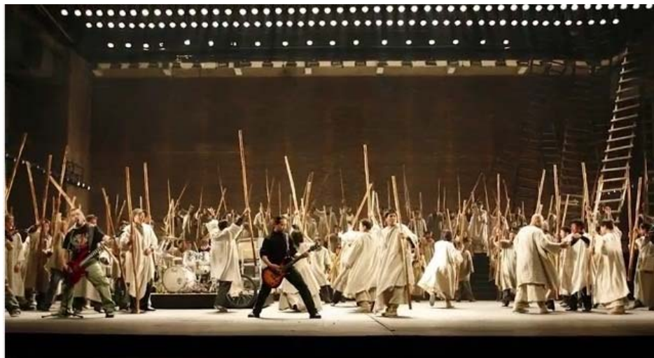
Cast and musicians, 'Coriolanus' from '2013 The Tragedy of Coriolanus' YouTube posted by EdintFest. Available from http://www.youtube.com/watch?v=MjKaUmLvQII