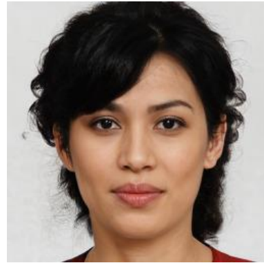
Fig. 2. Dark Lady: