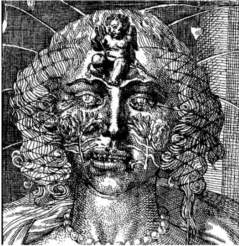
Fig. 3. Woodcut printed in 1654 parodying the literary blazon of the face through a literalization of Petrarchan metaphors. (Sorel 24)

impersonal and interchangeable as a lung or liver. 6 It is not surprising that one of the earliest efforts of facial recognition A.I. involved algorithms for racializing the face alongside such identifications as gender and age. 7