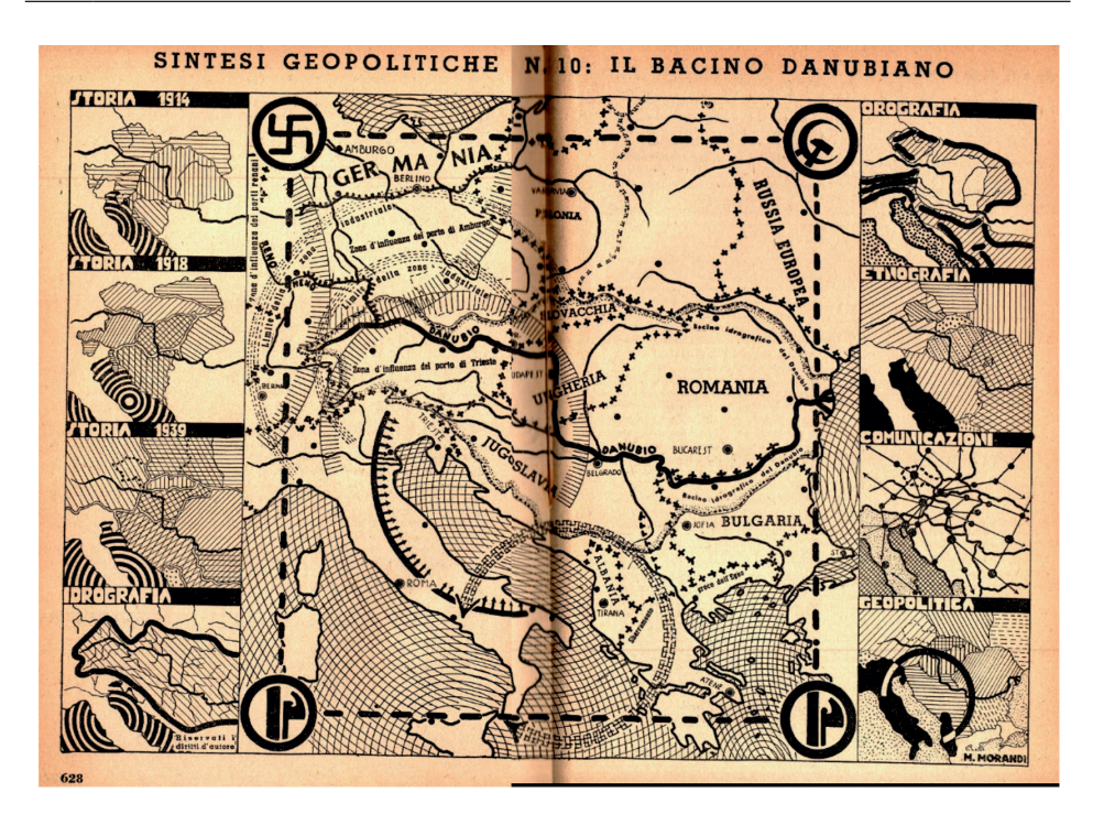
Fig. 2. Map of Morandi's Sintesi geopolitiche, No. 10: Il bacino Danubiano

The political thinking of the republican Giuseppe Mazzini (1805–1872) was also reinstated: his thoughts, expressed in the Lettere Slave <sup>20</sup>, were decontextualised and distorted in order to build a solid excuse for Italian expansionism (Scocchi 1940: 486–490).