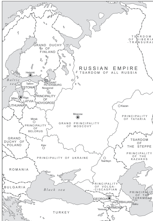
Fig. 1. Political division of the Russian Empire under the rule of the tsar Alexander I

revolutionary moods in the Kingdom of Poland and the loyalist attitude of Finns towards legal authority of the Russian monarchs translated into a different tsarist policy towards each of them. A quick look at the history of Finland may create such an impression, but deeper analysis indicates the astonishing resemblance of the Russian policy towards both nations regardless their loyalty. In order to understand why it was possible, it is necessary to recall a few of the most important facts from the history of Finns and Poles.