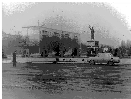
Fig. 1. Entrance to the city of Artemivsk in Lugansk region. Monument to Artem

The urban infrastructure is obsolete and local mayors are considered successful when they provide some cosmetic improvements to city centres. The European football championship of 2012 left behind a few stadiums and hotels in Donetsk, but had nothing like the impact on the economy promised by the Yanukovich government (Zhurzhenko 2014).