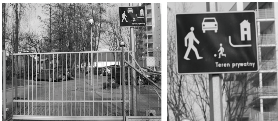
Fig. 2. Protective signs (fence) and appropriating signs (road sign, D-40: residential area with additional information about private property)

above, gated communities exemplify a social subsystem with a clear-cut enclosed territory and an spatially isolated character. Many a time there are protective signs in the immediate vicinity of such communities, which are both a symbolic and real barrier aimed at strangers; there are also appropriating signs serving as a means of marking the territory and informing potential trespassers that it is occupied (fig. 2).