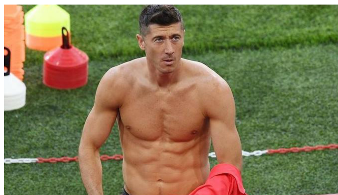
Foto 2. Robert Lewandowski during the World Cup in Russia.