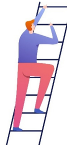
Figure 1. Hart's Ladder

Source: Hart 1997, cited in: Coyne, Carter 2018: 11. Image from canva.com