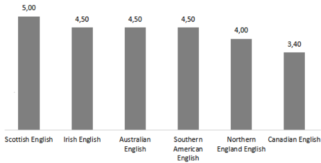
Figure 2. Participants' familiarity with the varieties of English (mean scores).

Despite the expressed necessity for a greater amount of exposure to different varieties of English, the results revealed that the respondents declare a certain amount of knowledge in this respect. The majority of the respondents would be able to recognise such varieties as Scottish English ( M=5.0 , Mo=7 , SD=1.7 ), which was closely followed by Irish English ( M=4.5 , Mo=5 , SD=1.9 ). Australian English ( M=4.5 , Mo=3 , SD=1.8 ) and Southern American English ( M=4.5 , Mo=7 , SD=2.2 ) received mean scores which indicated an above average familiarity, however they differed greatly in terms of the distribution of the responses. The graduates declared that they possessed an average concept of the Northern England English accent ( M=4.0 , Mo=4 , SD=1.9 ). As for Canadian English, the participants rated their familiarity with the accent somewhat below average ( M=3.4 , Mo=2 , SD=1.9 ).