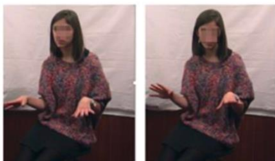
Fig. 2 pronunciation-related multimodal communication strategy (Kosmala, 2021 p. 258)

Building on the work of Gullberg, Kosmala (2021) examined an instance of pronunciation-related difficulty during an interaction between an American L2 learner of French and a native French speaker where NNS had difficulty with the pronunciation of a word in her target language, and visibly requested assistance by gazing towards her interlocutor, and keeping her hands in the same position (Fig.2). NS understood her partner’s request and took the floor to provide phonological repair.