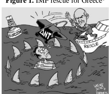
Figure 1. IMF rescue for Greece<sup>1</sup>

The political cartoon (Figure 1) depicts the EU as a body of water, thus forming the metaphor of the monomodal kind THE EU IS BODY OF WATER