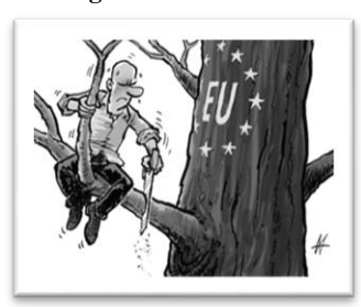
Figure 10. EU is tree<sup>7</sup>

The theme of cutting the ties with the European Union is considered in the cartoons (Figure 9, 10). based on the source domain PLANT (TREE). In both of them the literal scene of the idiom don't cut the branch you are sitting on (for the discussion of literal scene, see Langlotz 2006) is depicted. In the first cartoon (Figure 9) to be analysed it is the UK that has sawn off its own branch of the EU tree, but is still trying to hold on it and, judging from the man's facial expression is cautious about its future fall.