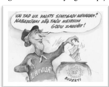
Figure 8. BREXIT by Agris Liepiņš

Another source domain identified while analysing the data is PLANT.