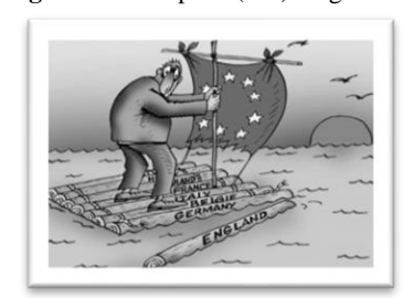
Figure 12. European (Dis)integration<sup>8</sup>

The metaphors in the last two cartoons (Figure 12, 13) to be considered are based on the source domain: WATER VEHICLE