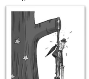
Figure 9. EU is tree<sup>6</sup>

Another source domain identified while analysing the data is PLANT.