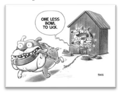
Figure 5. EU is kennel<sup>3</sup>

Another political cartoon (Figure 5) drawing on Brexit divorce contains the visual metaphors EU IS KENNEL, and EU MEMBER STATES ARE DOGS living in the kennel (EU); after Brexit the EU states are afraid of losing one of the biggest bowls, i.e. money sources previously available from the UK.