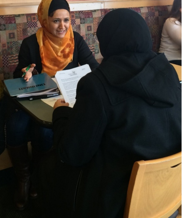
Figure 1. The first author as a hijabi researcher interviewing a Muslim women in a local public space.