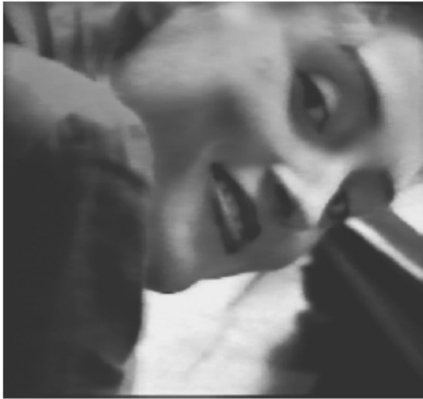
Frames from the Carte D'Or advertisement

At the beginning of the second advertisement, produced for a telecommunicator and teleoperator (Nokia, Sonera and Päämies), fingers tap on the table with a punchy sound-effect in a big close-up.