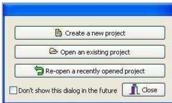
Graphic 1. First step options

When we launch the QDA MINER we have three options to choose: create a new project, open an existing project or open a project that we have recently opened. It is visible on a graphic below.