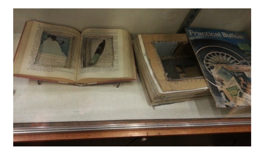
Image 3. of a display featuring a prisoner-made weapon at the Federal Penitentiary Museum.

that female prisoners often had to be physically restrained after spending prolonged isolated periods in their cells. An explanation of the special meal and recess schedule developed to ensure specific groups of prisoners did not cross paths and come into conflict with one another emphasized the inherent dangerousness of the people incarcerated at the facility. One display in the "Contraband" exhibit at the Federal Penitentiary Museum in Kingston, Ontario, features a stack of cafeteria food trays fused together and hollowed-out by a prisoner in order to facilitate his escape, which was unsuccessful and made the local news. This exhibit also includes lock-picking kits smuggled in or assembled by prisoners. Such displays imply prisoners are unpredictable and untrustworthy, and stress the need for additional security measures and safety precautions to be taken when working with this population.