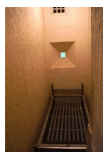
Image 5. Photo by Alex Luscombe of a prison cell at the former Middlesex County Gaol.

The final sub-category identified addresses discourses of "past and present" or "then and now." In the "Suicide cell block" at the Old Lindsay Jail in Peterborough, Ontario, a particular informational display sets out to visitors what it was like for captives "living in an 1863 jail cell," describing cells as "no bigger than a closet" and claiming "prison life was a wake-up call and something [prisoners] did not want to return to." This description conjures images of a time before running water, electricity, and other contemporary comforts visitors take for granted, while suggesting these conditions were nothing short of justice served for "law-breakers" at the time. The Federal Penitentiary Museum in Kingston, Ontario, takes a similar exhibit one step further by recreating a side-by-side comparison of a typical tiny cell from 1835-1906 with a comparatively larger one from 1998-present (see: Walby and Piché 2011). These representations of conditions of confinement for prisoners "then" and their present-day counterparts foster social distance between museum visitors and prisoners by allowing penal spectators to feel relieved at the "progress" made, or possibly to view prisoners today as "having it easy."