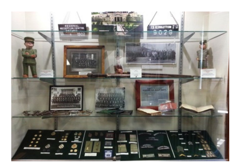
Image 7. of staff badges displayed at the Federal Penitentiary Museum.

guard uniforms, a collection of badges and buttons is on display at the Federal Penitentiary Museum in Kingston, Ontario, most of which are emblazoned with red and gold maple leafs and the crown of the British monarchy. Featured awards are also displayed, including those for bravery, honor, peacekeeping, and commemoration. The symbols on these insignias demonstrate the level of reverence shown for penal system actors and their line of work for having to deal with prisoners on a daily basis.