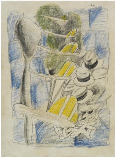
Il. 2. Henryk Streg (Marek Włodarski), Rysunek z kapeluszami , 1930, ołówek, kredka, gwasz, papier, 26,5 x 19,5 cm, Muzeum Sztuki w Łodzi.