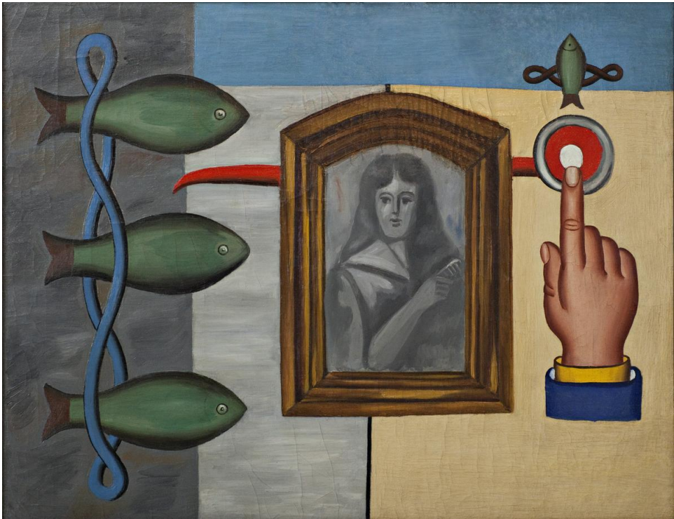
Il. 1. Henryk Streg (Marek Włodarski), Ryby i portret , 1930, olej, płótno, 65 x 82 cm, Muzeum Sztuki w Łodzi.