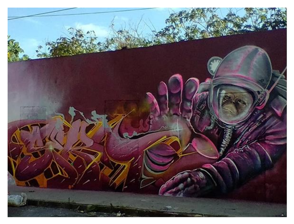
Photo 6. El Refugio 2020 Cultural Festival, Monkey Kings crew.

(...) such is the case of the "Graffiteros," whose youth identity is constituted from a way of living in the city, of relating to the urban space and of leaving a trace of their existence (Cruz, 2010, p. 108).