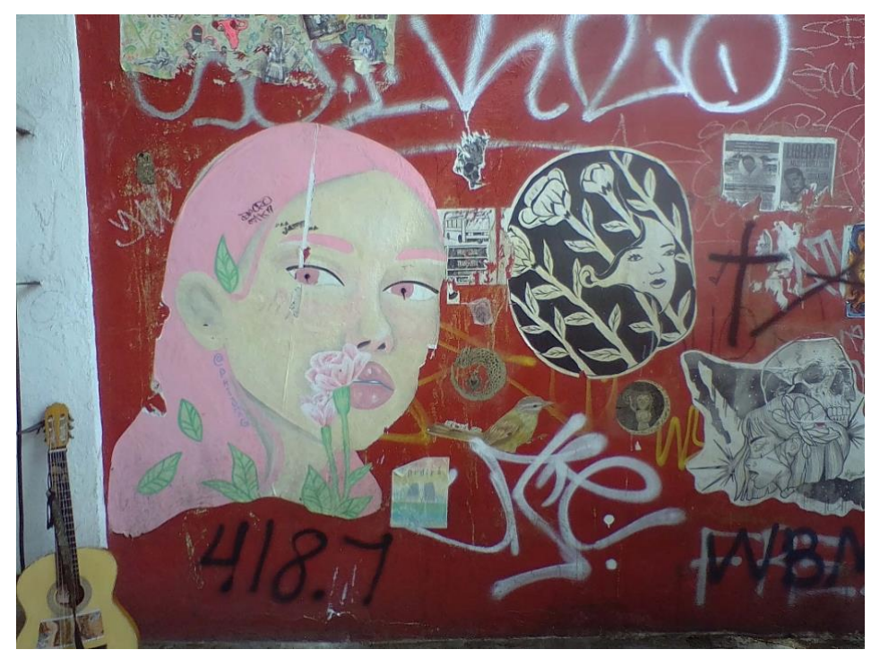
Photo 4. Graffiti and art in the Historic Centre of Puebla 2021.