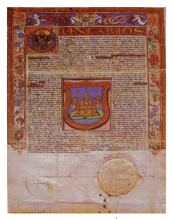
Photo 1. Royal Certificate for the City of Puebla de los Ángeles. Awarded by Carlos V, King of Spain.

The city was officially founded on 16<sup>th</sup> April 1531 and named Puebla de los Ángeles, which literally means "City of Angels" it emerged as a utopian city, conceived as a place to experiment with Renaissance ideas about society, a city of commerce and rest. It was thought to be run by Spaniards, industrialists, merchants and various religious orders that built a large number of churches. In 1538, Puebla received the appointment and royal certificate of the King of Spain, Carlos V, and was called "a very noble city." The city was tax-free for thirty years to foster the development of new industries that were subsequently established. Civil buildings and convents were also built, making the centre of Historic Puebla the second most important city of New Spain (see e.g. Hirschenberg, 1978, pp. 185–223).