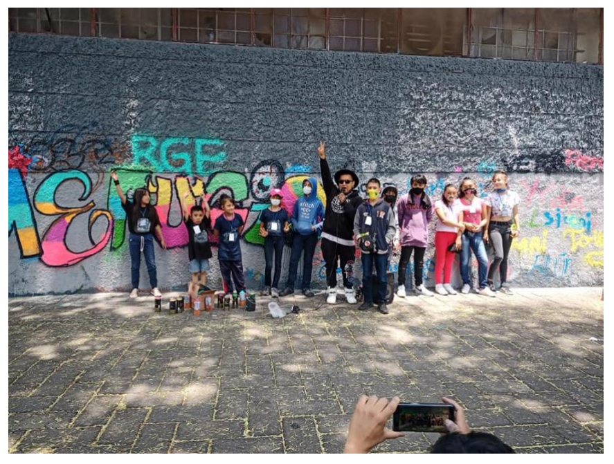
Photo 13. The second session of the "Graffiti in a minute" workshop with Dayetos and WarRior, El Refugio Cultural Festival, Re Genera Espacio and Plasma Urbana, in progress, 2021.