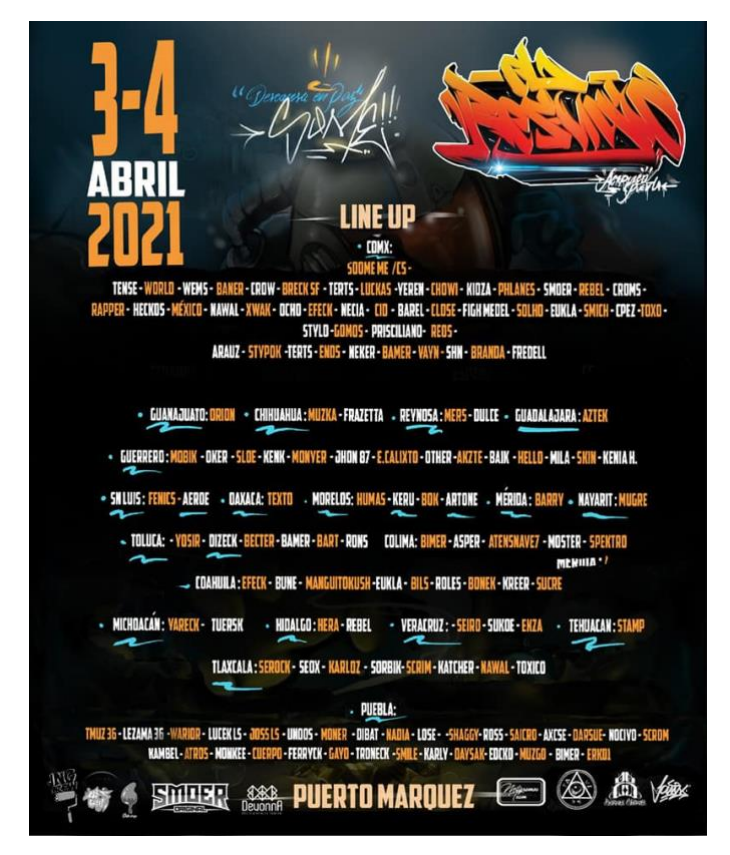
Photo 7. Poster of the El Refugio Cultural Festival, Puebla, 3–4 April 2021.

The graffiti community all over the world names the productions, the practice and the graffiti artist in the same way. The name of the productions are not only globally recognised but keep the same forms; among these are tags or signatures, throw-ups, bombers, wildstyle, deltas, comics, stencils or templates, stickers or labels, pisone, etc. (Cruz, 2010, p. 115).