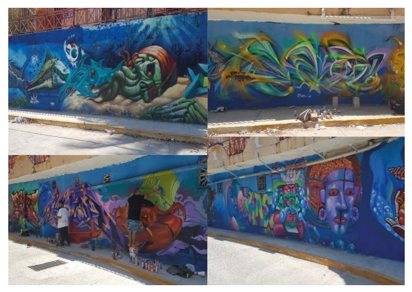
Photo 10. El Refugio Festival Cultural, 2021, Puerto Marques, Acapulco, Mexico.

For artists, the festival is a benchmark in the local and national scene in the world of graffiti. One of the key points is the recognition of the work, either for its illegal nature and its production or for the scope of its crew. Hence, the festival has become a platform to "raise the level" of graffiti in Puebla, giving large-format canvases to artists and groups who see the Refuge as a meeting point for artists from the central-southern region of the country, which is also an opportunity for those who want to start working with graffiti, since the festival tries to give space to all those interested.