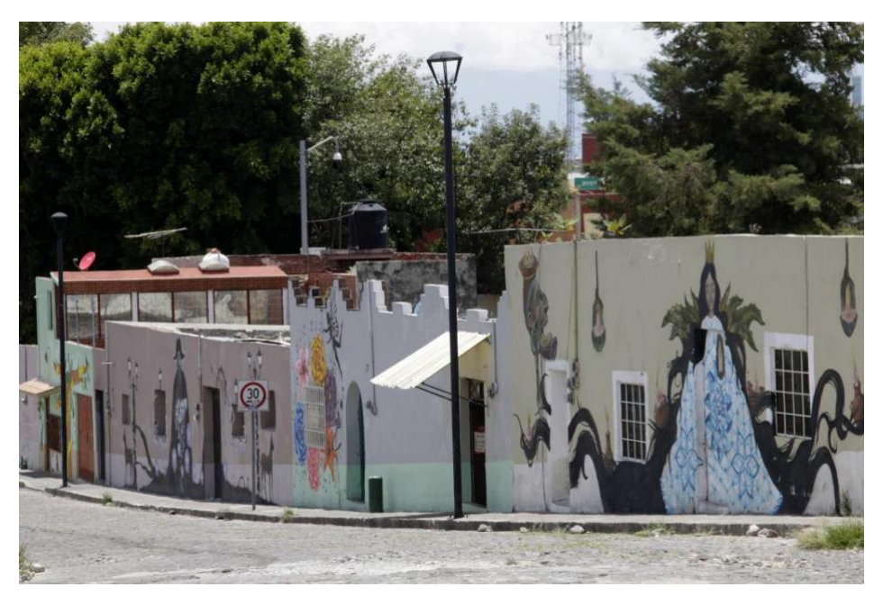
Photo 3. Xanenetla neighbourhood, intervention by Colectivo Tomate in 2012.

However, in the year 2021, their activities were paralysed not only by the Covid-19 pandemic but also due to the fact that the project "Ciudad Mural San Luis Potosi" was suspended as a result of the actions of a group of national artists. A letter addressed to the city council was prepared to denounce irregularities of the Colectivo Tomate group and appeals were made for the murals to be made by other authors.