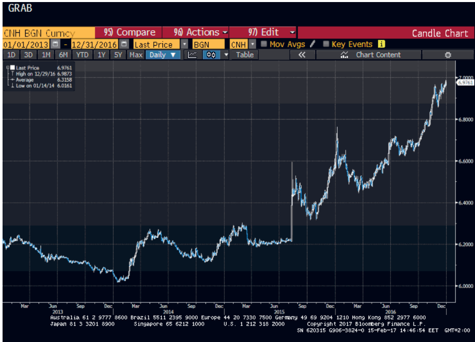
Chart 3. USD/CNH (Yuan offshore): January 2013–December 2016 Source: CNH Currency (GO), Bloomberg [access 14.02.2017]

The idea of creating the Chinese Yuan offshore market (CNH) and the pressure to achieve reserve-currency status by the Yuan onshore market (CNY) smack of marketing activities rather than a step towards financial development due to the Chinese currency’s lack of full convertibility.