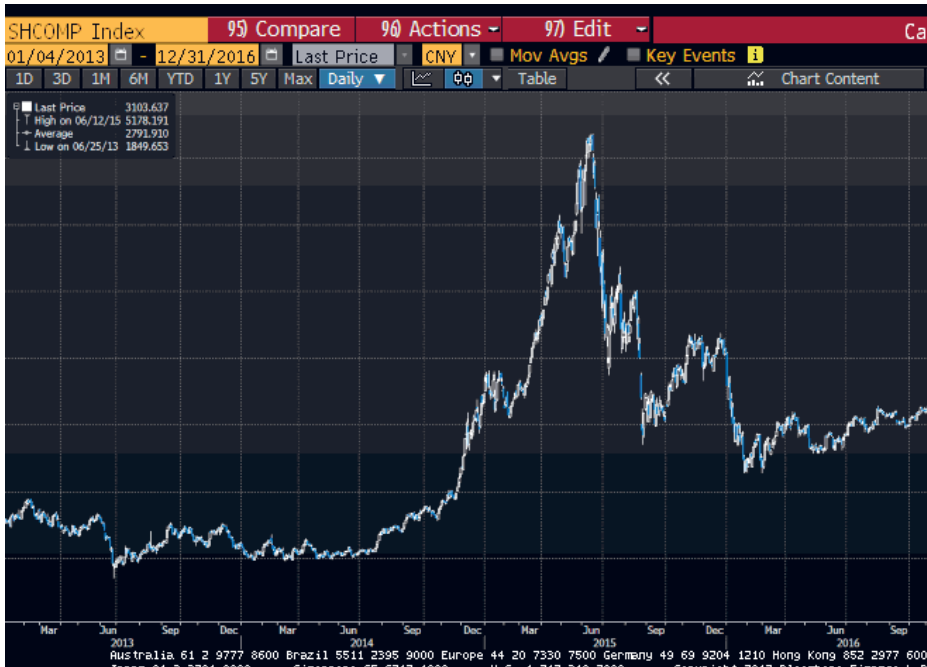
Chart 1. Shanghai Index Quotation: January 2013–December 2016 Source: SHCOMP Equity [Go], Bloomberg [access 14.02.2017]

The Chinese domestic financial system consists of a wide range of financial markets such as: the FX market (including CNY FX spot, FX forward and FX swaps transactions), the credit market (based on SHIBOR quotations), bond market and stock exchanges. Such an infrastructure is typical for the capital economy where the prices of financial instruments and assets are prone to volatile and rapid changes caused by economic data or politics, despite the will and expectations of CPC leaders. In the summer of 2015, a 30% drop of equity prices triggered CSRC action to freeze prices for half a year despite the fact that more than 80% of equity belonged to individual investors (China Daily/Reuters).