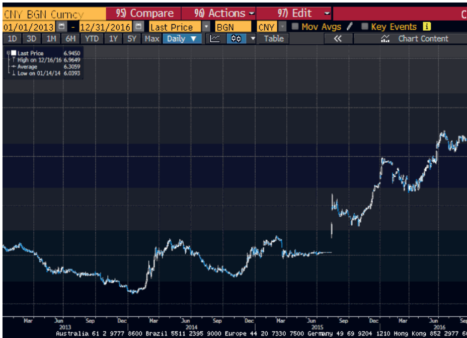
Chart 2. USD/CNY (juan on shore): January 2013–December 2016 Source: CNY Currency [GO], Bloomberg [access 14.02.2017]