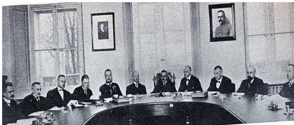
The Cabinet of Władysław Grabski – 1924.

On 12 April, 1924 W. Grabski was awarded the Great Ribbon of the White Eagle Order.