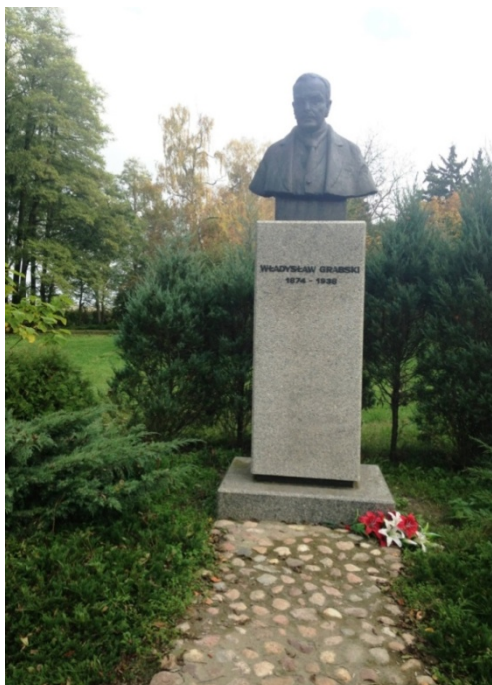
The monument of Władysław Grabski in Borów

He became engaged in the Central Agriculture Society, whose committee member he was since 1907. In the years 1913–14 he was the vice – chairman of the Society and the head of the office. W. Grabski founded the Bureau for Social Work and became its director in 1913. The Bureau's activities were aimed at providing public education and erecting school buildings. At that time he also worked on publishing the Statistical Yearbooks of the Congress Kingdom of Poland.