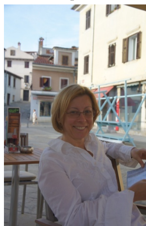
Slovenia 2010