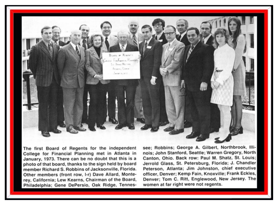
Photo 5. The first Board of Regents for the Independent College for Financial Planning (1973)