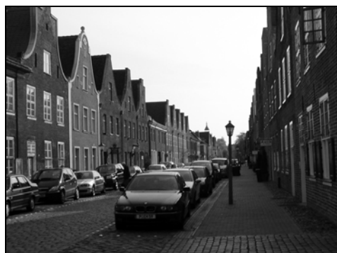
Fig. 4. Holländisches Viertel : the buildings seen from the street form a continuous row

The front walls of old buildings, adjacent to the street, were reconstructed with great care to restore their historical shape, but the inner spaces were reconstructed in an innovative way. Substandard elements of existing development like sheds, side-buildings and outbuildings were demolished, giving way to new arrangement of space – attractive recreation areas, playgrounds and green spaces were provided, as well as utility spaces for residents of adjoining buildings. At the back side of some of the buildings were built terraces and small gardens, offering a unique possibility of having private open space in the heart of the city (figures 3–5).