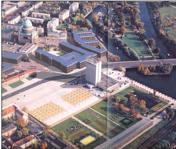
Fig. 8. The City Centre Revitalisation Area: visualisation of the new building of the State of Brandenburg Parliament, built in the place of the former Royal Palace. A new traffic solution for this area is also visible, including a new street going round the proposed Parliament building corner, the pedestrian zone near the city centre and green areas near the river bank, being a part of the former National Garden Exhibition

The first step towards the implementation of this idea was the reconstruction in 2002 of the historical Portal of Fortune (Sanierungsträger Potsdam, 2001b), the former main entrance to the Palace from the Old Market square.