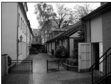
Fig. 5. Holländisches Viertel : in the interior of the blocks open spaces were created – public, semi-public and private, giving the feeling of intimacy in spite of living in the city centre