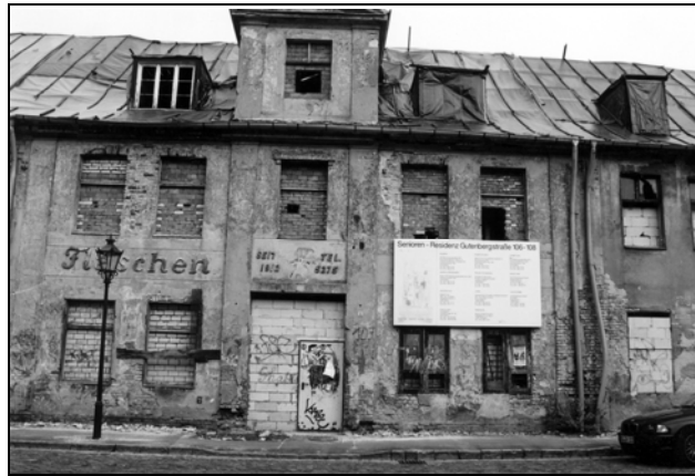
Fig. 1. Buildings in the historical centre of Potsdam at the beginning of the 1990s were mostly in a disastrous technical condition

During the last years, thanks to numerous revitalisation projects, many other historical monuments and places, too, were restored and gained new life, enriching the stock of valuable cultural heritage objects of the city: the Old Market Square ( Alte Markt ) and the New Market Square ( Neue Markt ), historical city gates and historical quarters – the Dutch Quarter ( Holländisches Viertel ) and the Baroque Quarter ( II. Barocke Stadterweiterung ).