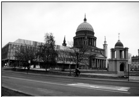
Fig. 6. The city centre was rebuilt in communist times, which destroyed its historical spatial structure: next to historical monuments new modernist buildings were constructed, of low architectural value

The ruins of the Royal Palace, which was destroyed during the carpet bombing in 1945, remained till 1961, when they were removed by the GDR communist government. In the 1970s, exactly in the place of the south-west corner of the former palace building, an out-scaled intersection of streets was constructed, which not only completely distorted the historical plan of the Old Market, but also annihilated social and cultural life in the most important central place of the city: the Old Market had always been the beloved, traditional place of meetings for inhabitants and visitors (figures 6–7).