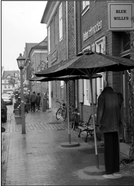
Fig. 3. Great care was taken – regarding the design, details, material, elements of small architecture and greenery – to upgrade both public spaces and private backyards