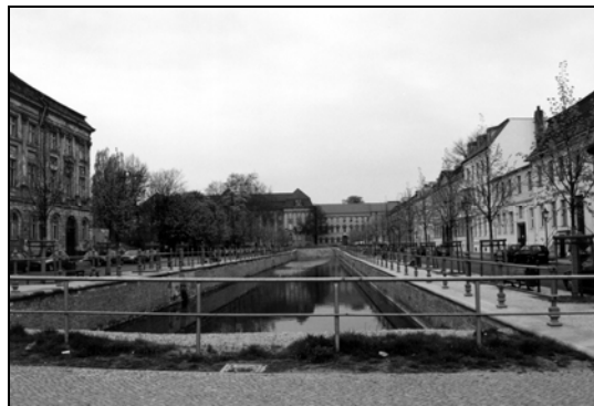
Fig. 10. One of the re-opened water canals – for the past few decades in this place was a transport artery leading heavy traffic

Water canals were important elements of the historical urban structure of Potsdam's central area. They constitute a characteristic feature of both the Baroque and the Dutch Districts. In 1722 King Frederic Wilhelm the First ordered the rebuilding of previous water trenches into Dutch style canals. After the Second World War they were decked and in this place new traffic arteries were constructed. It was decided, as part of the revitalisation programme, to have them re-opened, as an important element of the city's identity. The projects of that kind have recently been implemented in many European cities and towns whose origin and development were closely related to water. 3