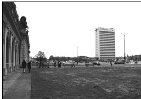
Fig. 7. The spatial composition of this part of the city was completely distorted by introduction of high-rise buildings and over-scaled intersection of streets