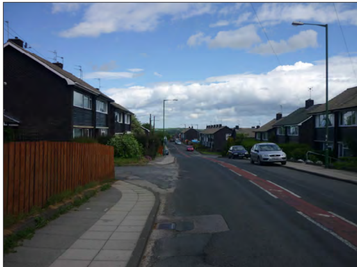
Fig. 2. Visual impression of Newton Hall, overview of Canterbury Road