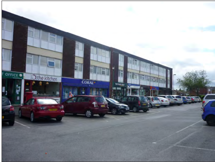
Fig. 1. Visual impression of Newton Hall, the local shops

shopping centre with several shops, a community building, a sports centre and a public library. The larger shopping centre 'Arnison Centre' serves a large part of Durham City among which is Newton Hall. Figures 1 and 2 provide an impression of the houses and the local shops in Newton Hall.