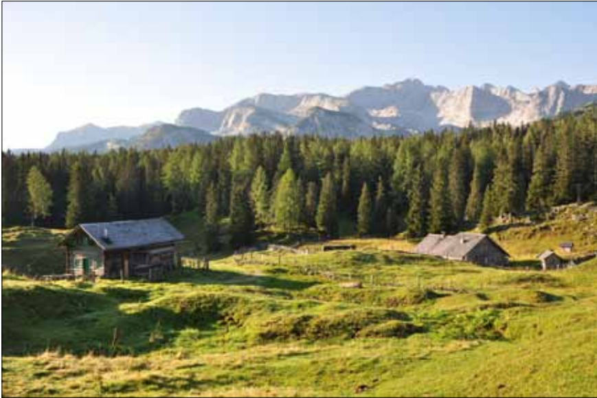
Fig. 3–5. Impressions from the UNESCO World Heritage Cultural Landscape Hallstatt-Dachstein / Salzkammergut