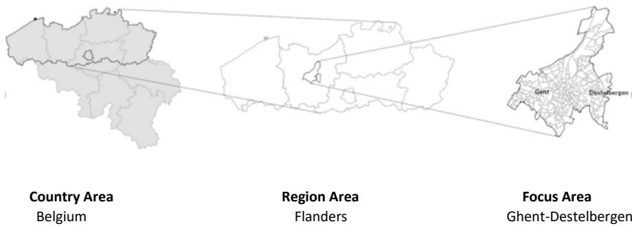
Fig. 3. Case study area as considered in REPAiR: country, region, focus area Ghent-Destelbergen

The Ghent-Destelbergen area is identified as the focus-area within the REPAiR Project (Fig. 3). It covers two municipalities, each legally responsible for the implementation of their municipal waste policies. Both municipalities delegate their authority for the collection and treatment of waste to the IVAGO inter-municipal organisation.