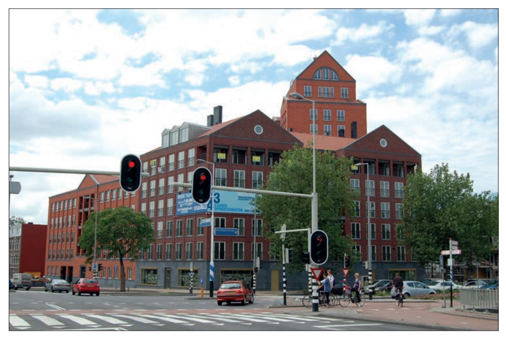
Fig. 1. Avant-garde design Nieuw Crooswijk (Rotterdam)