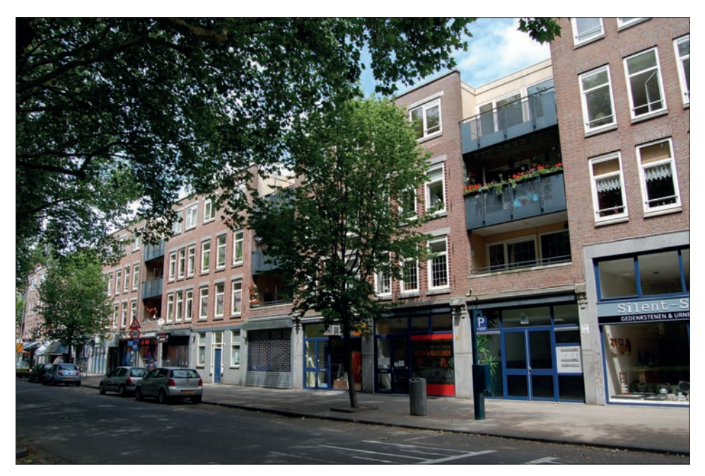
Fig. 5. Saved from demolition