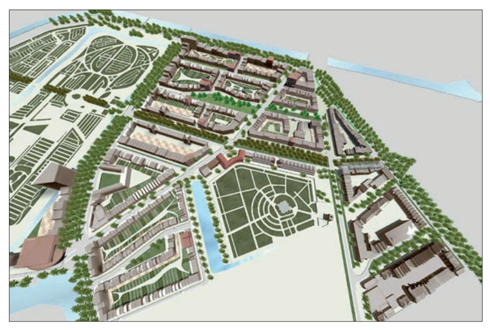
Fig. 4. Land use plan Nieuw Crooswijk (2005) as proposed by OCNC private partnership