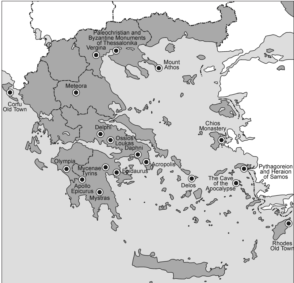
Fig. 1. The UNESCO sites of Greece