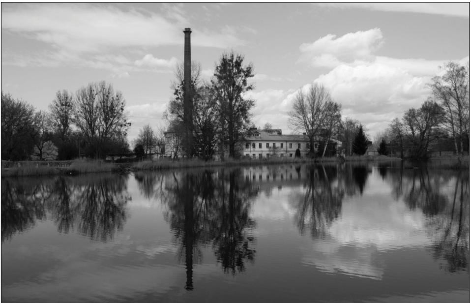
Fig. 5. Paper mill in Mirków