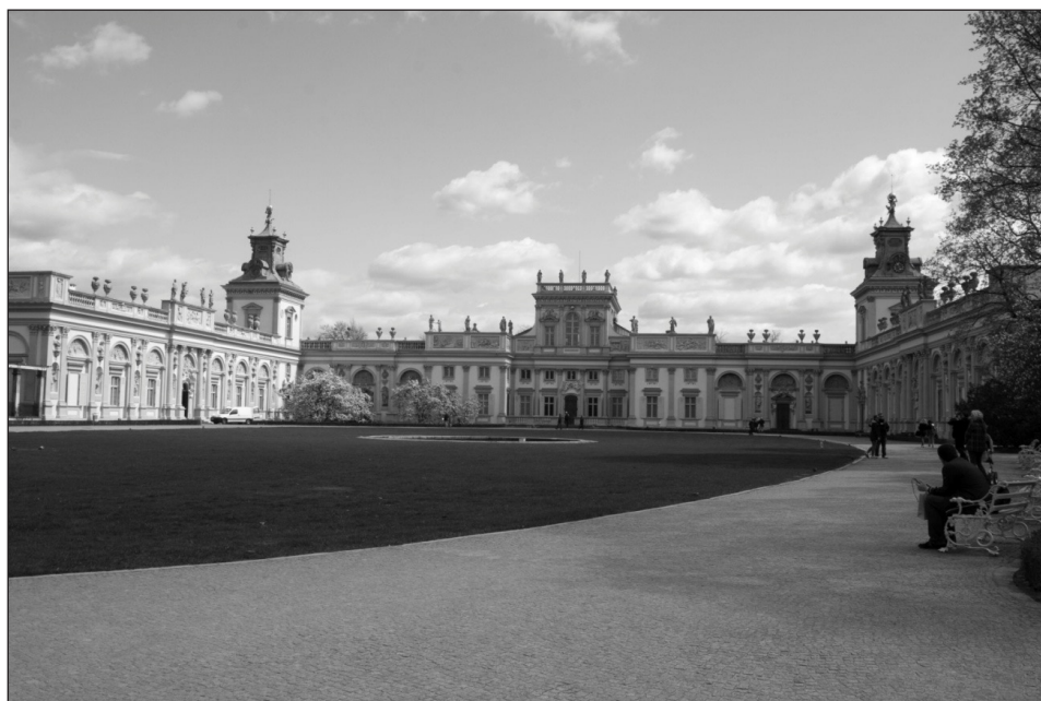
Fig. 2. Baroque manor and garden complex of Jan III Sobieski – the most important element of the Wilanowski Cultural Park area

The most important element of the Wilanowski Cultural Park area is the baroque manor and garden complex, erected at the end of the 17th century for King Jan III Sobieski (Fig. 2). In the times of King Jan III all the most important elements were shaped that have later become the cornerstones of the cultural landscape of Wilanów – the palace, garden, park, farm and the surrounding fields, meadows and forest patches. A visible element of the landscape in the palace's surroundings was a 400 meters long water channel located in the axis of the complex and directed to the West, towards Skarpa Warszawska (Szpanowski, 2006). The contemporary appearance of the complex is the result