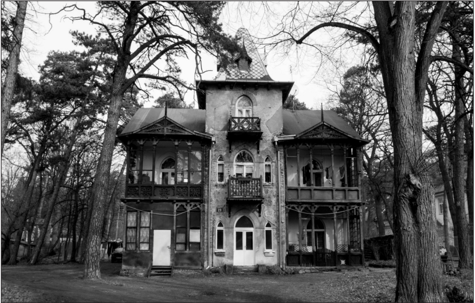
Fig. 4. Old villa in Konstancin