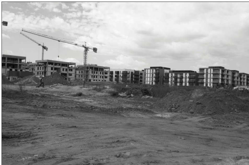
Fig. 3. Intensive urban development in the Wilanowski Cultural Park area