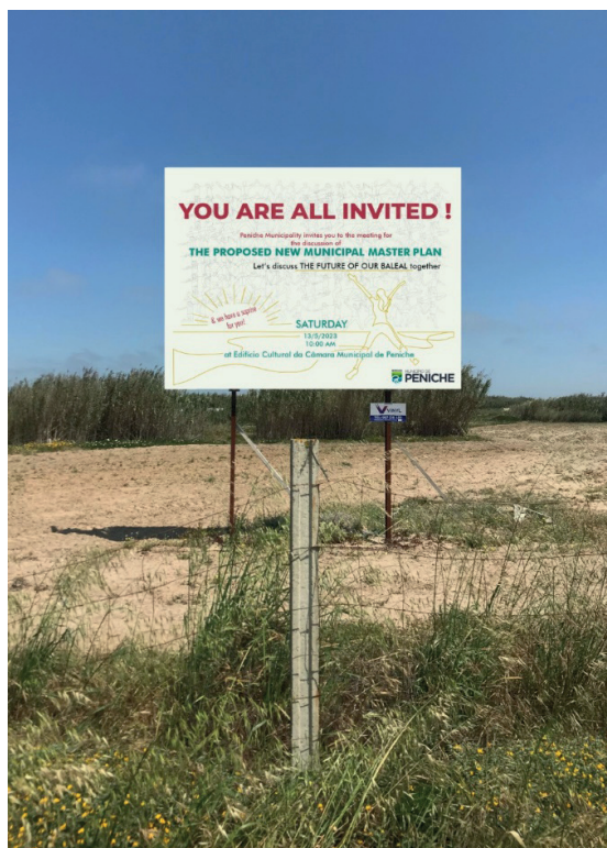
Fig. 3. A proposed form of invitation to public consultations