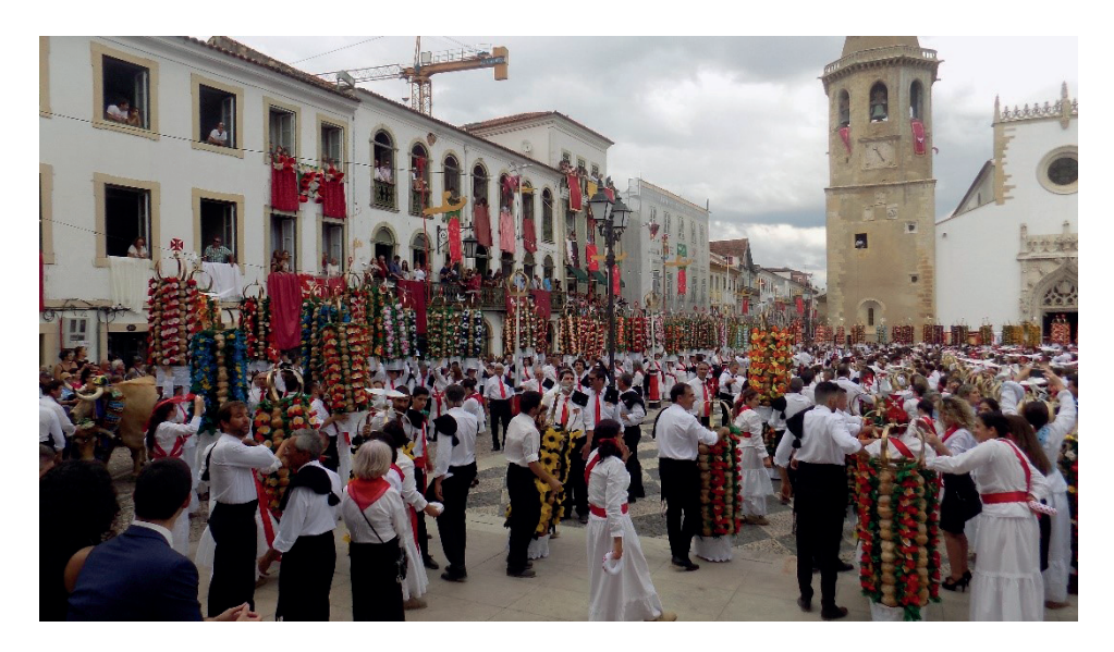
Fig. 1. Festa dos tabuleiros (festival of the trays)

to banquets and bodos , and also parades) it is spread all over mainland Portugal, with particular incidence in the regions of Extremadura and Beira, and also on the islands of Madeira and the Azores (Dionísio et al. , 2020).