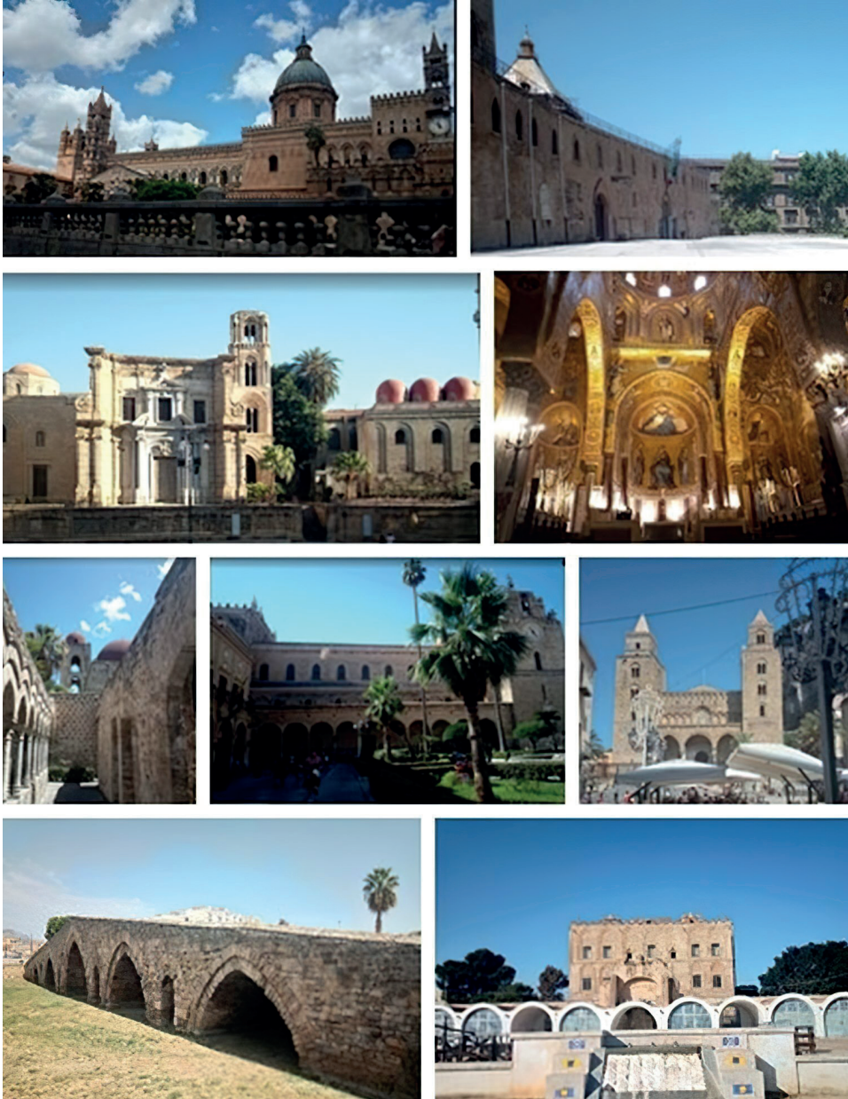
Fig. 2. Overview of the monuments included in the serial World Heritage Arab-Norman Palermo, the Cathedral Churches of Cefalù, and Monreale serial site