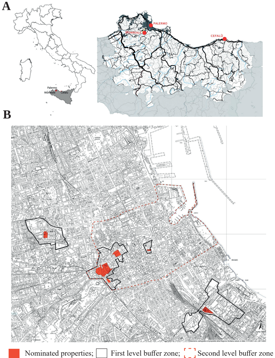
Fig. 1. National and regional maps (A) indicating both location and extension of WH Arab-Norman Palermo and the Cathedral Churches of Cefalù and Monreale serial site; provincial map of Palermo (B) showing the distribution of the seven WH properties in the city