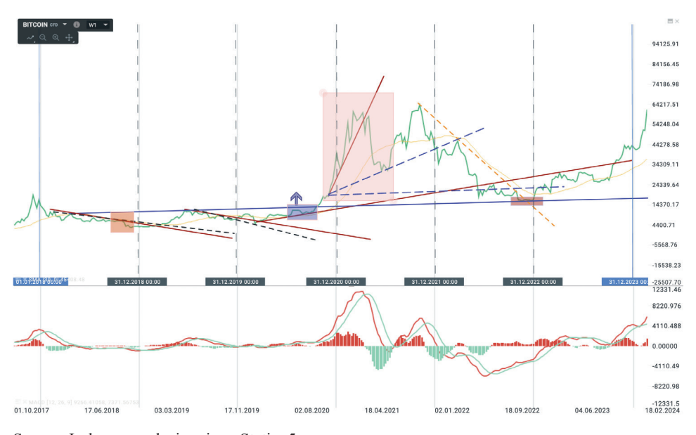
Figure 1. Bitcoin exchange rate in the period 2018–2023

The chart below shows a study of the Bitcoin cryptocurrency exchange rate, where the quote currency is the US dollar in the period 2018–2022 using trend lines and the EMA and MACD indicators.