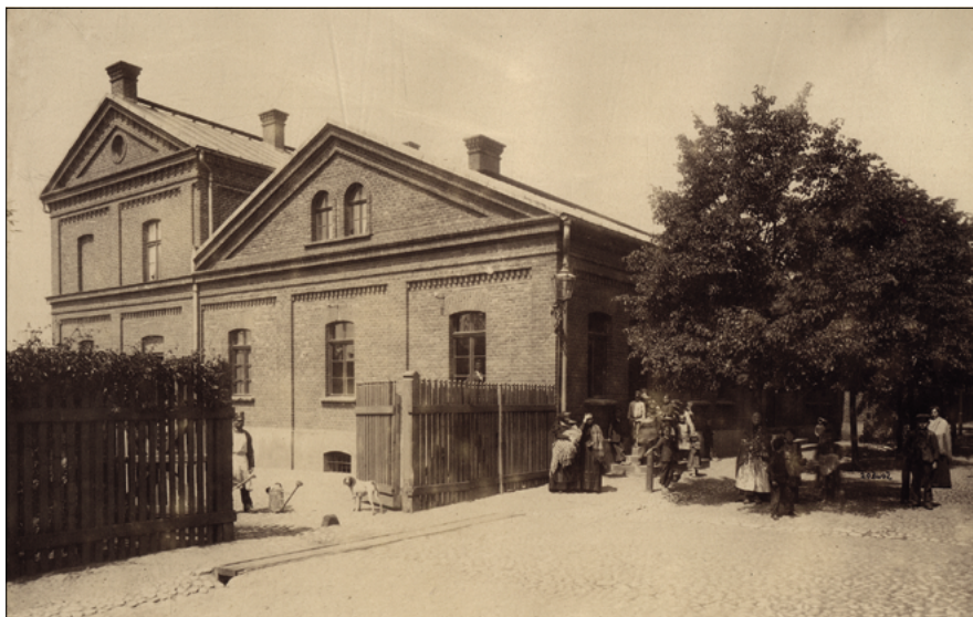
Fig. 6. The Konsum building. A view from the south-east as of the end of the nineteenth century (c 1885?), source: APE, Zb.ikon. SiG: 239.