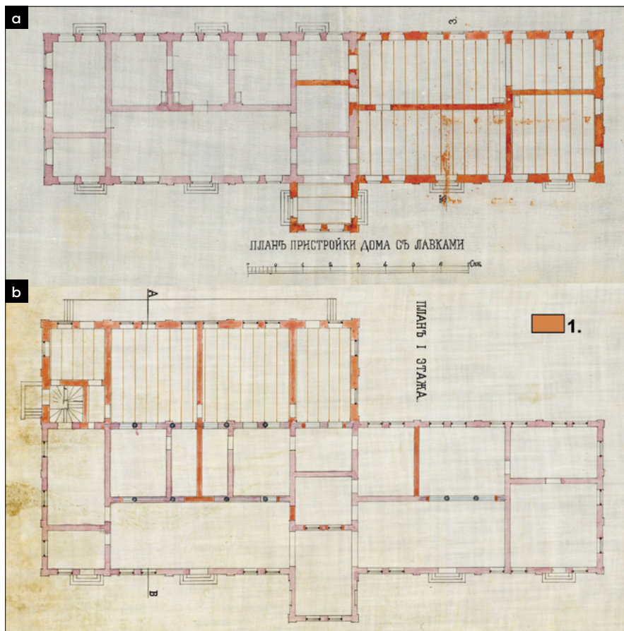
Fig. 4. The Konsum building; a. – A ground floor plan on the design of the first extension (Stage II), 1883, source: APŁ, RGP, WA 1661: 156; b. – A ground floor plan on the design of the third extension (Stage IV), 1890, source: APŁ, RGP, WB 1586. Legend: 1. Newly planned elements of the building.

this structure was marked in a layout drawing attached to the design concerning the area near the storehouse (APŁ, RGP, WB 1569). Moreover, the fact that the ice house is not marked in a similar drawing to a design of an adjacent storehouse drawn up on July 15/27, 1889 (APŁ, RGP, WB 1569) seems to indicate that it was constructed between these dates. Unfortunately, it is excluded by the fact that no significance was attached to updating the layout drawing when creating plans for Scheibler's plants and submitting them to authorities for approval. For example, the ice house in question was marked on a plan dated February 22/March 6, 1891, but it is missing from the plans from August 25/September 6, 1891 and from July 19/31, 1893 (APŁ, RGP, WB 1867; 2248; 3358).