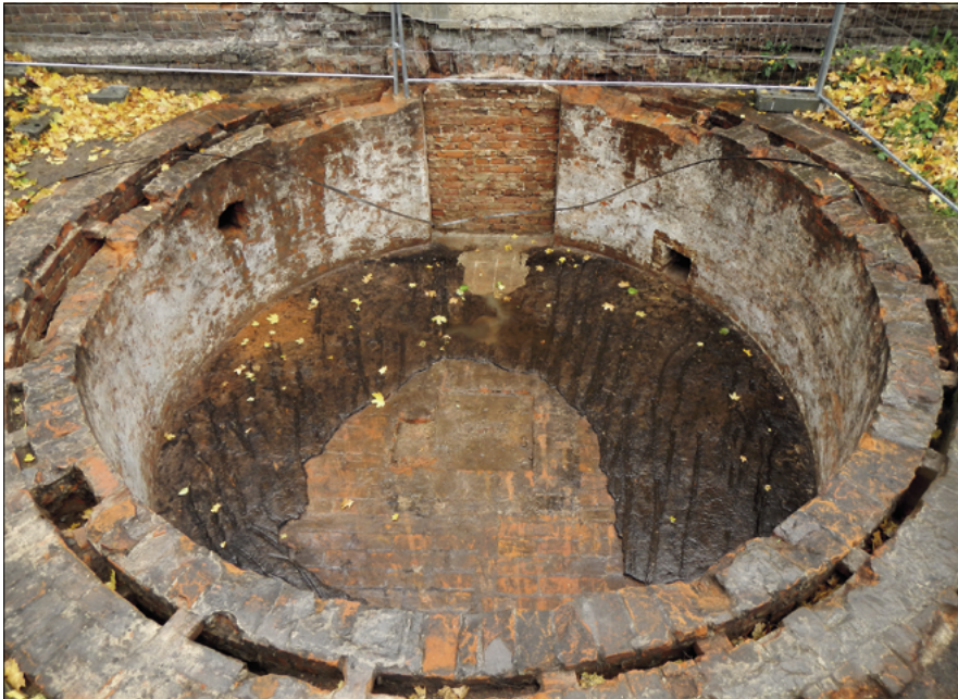
Fig. 8. The remains of the ice house at the Konsum building. A view from the north as of 2015, photograph by Z. Rybacki and M. Milczarek.

Virtually the only part of this structure that has survived until today is the underground section (Fig. 8). Paradoxically, this allowed to determine the method of building the perimeter wall of the main part. It consists of two concentric brick rings with outside diameter of up to 6.34 m. The external one is 0.40 m thick (which corresponds to 1.5 brick lengths), while the internal one is 0.27 m thick (which is the length of one brick). The first of these two rings seems to have English bond brickwork, while the other – header bond. Both are separated with a space of approx. 0.10 m and they are joined with regularly spaced, one-brick tie-beams staggered every two layers. Both external and internal wall faces originally had no