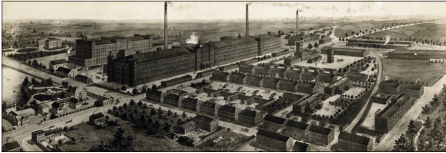
Fig. 2. The factory and residential complex Priest's Mill; a. – As of the period between 1897 and 1899; source: APŁ, Zb.alb.ikon., sygn. A-103, k. 2, photo 1.

(Kajzer 1981; Kobjek 1998: 78–79; Pawłowski et al. 2001: 11, 14, 5B, 6B; Salm 1998: 66–67; Filipowicz 2012), however, none is exhaustive 7 .