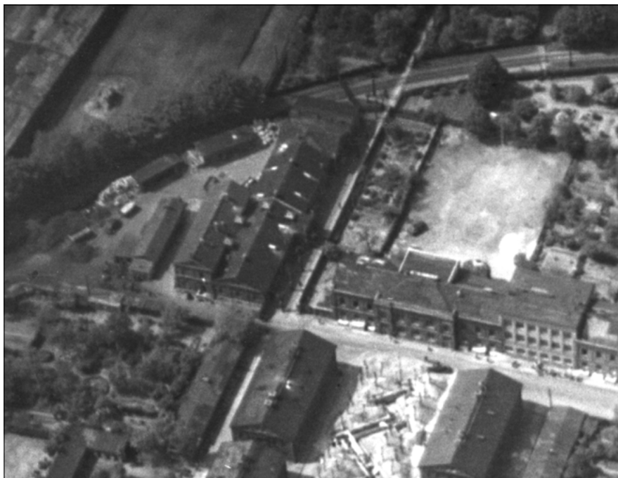
Fig. 5. The Konsum building on an aerial photograph from the Second World War, source: BFM, fm931927 (fragm.).

Secondly, there is no data that would allow us to determine the date of demolishing the structure. The archival survey did not provide any relevant information about it. The fact that the ice house is marked on the map of Łódź published by Kazimierz Jasiński in 1917 (APŁ, AMŁ, WT 21142) seems to suggest that it still operated at the time, however, this map is only a re-edition of an older map of Władysław Starzyński (Fig. 1b), which reflected the situation from the beginning of the last decade of the nineteenth century (APŁ, Zb.kart. 1), i.e. soon after the ice house had been built. Community interviews did not provide any useful information either as despite some opinions that the structure was liquidated when electric store freezers became popular in the 1960s 11 , people who had lived in the Priest's Mill for a few decades much more frequently said that they did not recall any such feature in this part of the estate. The last information seems to be confirmed by analysis of barely legible German aerial photographs taken during the Second World War, which suggests that the ice house might have been