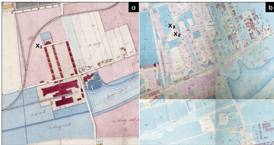
Fig. 1. The factory and residential complex Priest’s Mill; a. – As of approx. 1873; b. – According to measurements from 1894–1896 with later improvements from 1904–1906. Legend: X1 – location of the Konsum building; X2 – the Konsum building; X3 – the ice house.

The ice house – apart from analysis of the results of the archaeological research mentioned above (Pietrzak et al. 2015) – has not been described in the literature concerning the establishment and the functioning of the Priest’s Mill estate (e.g. Popławska 1964: 298–306; 1972; 1992: 68–69, 94–99; Szyburska 1976; Turowski 1976; 1976a; Puś 1979; Pytlas 1979; 1998; Markiewicz-Kozańska 1982; 1984: 137–141; 1991; Kobjek 1998; Salm 1998; 2001; 2007; Stefański 2001: 97–101; 2003: 58–59; Walczak 2007; 2010: 103–105, 230; Tomczak 2012) or mostly unpublished conservator’s studies (e.g. Szyburska 1972; Kajzer 1981; Pawłowski et al. 2001; Filipowicz 2012). Moreover, some of the above works fail to mention the store, while others only acknowledge its existence (Szyburska 1976: 106, 107, 112; Markiewicz-Kozańska 1984: 134, 136; Pytlas 1979: 72, 166; Salm 2001: 49; 2007: 75; Szymański 2006: 58; Tomczak 2012: 12; Walczak 2007: 63; 2010: 103, 104, 230), and only few devote more attention to it from different scientific perspectives