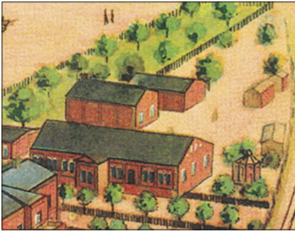
Fig. 10. The ice house at the Konsum building. A view from the north-east as of the period between 1897 and 1899, source: Zjednoczone zakłady... (fragm.).

The general appearance and operation of the ice house described here can be to a certain extent supplemented with observations made based on its representation in a perspective veduta of the Priest's Mill estate showing its state between 1897 and 1899 (Fig. 2).