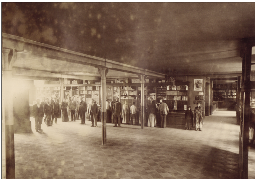
Fig. 7. The Konsum building. Interior of the shop floor as of the nineteenth century (c 1885?), source: APE, Zb.ikon. SiG: 240.