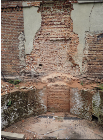
Fig. 9. The Konsum building. The northern elevation of the one-storey part with the remains of the ice house wall. A view from the north as of the summer of 2020

insulation space 17 , and above them the ice house wall was a solid brick wall.