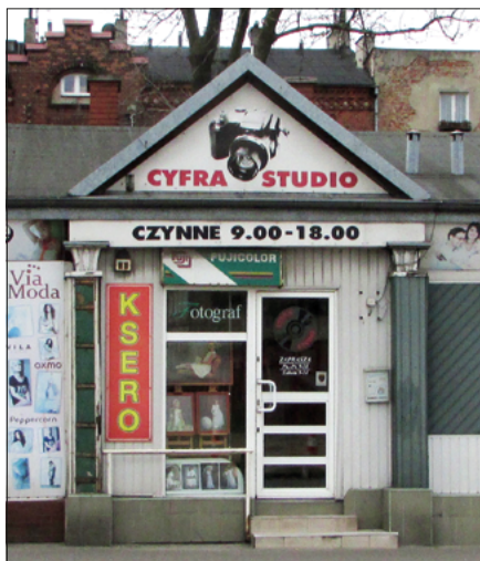
Fig. 17. The preserved column capitals and the triangular gable added to the elevation of the building at 38 Długa Street.

and this, in turn, ended in the building's slow technical death. The district register of monuments, on the other hand, offered no legal tools that could force property owners to take any measures. This presented a paradox as listed monuments were in a worse condition than the unlisted; the latter were used and renovated, while the former deteriorated. And yet most original historic substance can be found in the listed buildings that have resisted the flow of time despite their disastrous condition.