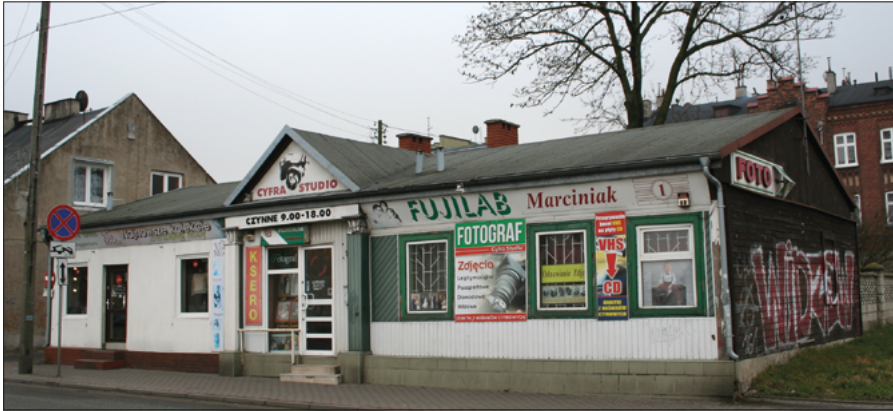
Fig. 12. The house at 38 Długa Street, today.

of the buildings (Jasiński 2002: 66–67). Examples can be the houses at 15 and 38 Długa Street. Starting in the 1980s, there were more and more negative changes (Fig. 9—12). In the conservator’s photographs taken by Mieczysław Pracuta in 1965, one can see that many of the houses described, at least on the outside, had not suffered much from the time of their construction. Thus, it is all the more painful that despite the fact that the historic houses were gradually covered with official conservator’s supervision, they received more and more adverse modifications over time, while their owners – including the Commune of Zgierz – failed to respond to this.