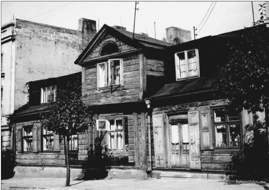
Fig. 9. The house at 15 Długa Street, 1960s/1970s.

After the Second World War, the historic craftsmen's houses were taken over by the municipality as most old owners and inhabitants had moved out, and communal flats were created there. This is when the most unfavourable period for the historical urban fabric started. The houses, initially single-family (rarely two-family), were divided into even as many as eight flats each. This entailed uncontrolled renovations using cheap materials unfit for the restoration of historic, mostly wooden, buildings. Ceramic roof tiles and wooden shingles were substituted with bitumen paper, and the original boarding was removed to install plastic siding boards. Window and door joinery was exchanged, which altered its original articulation. In many cases, this led to the disappearance of the architectural detail, or even complete erasure of the visible historical value