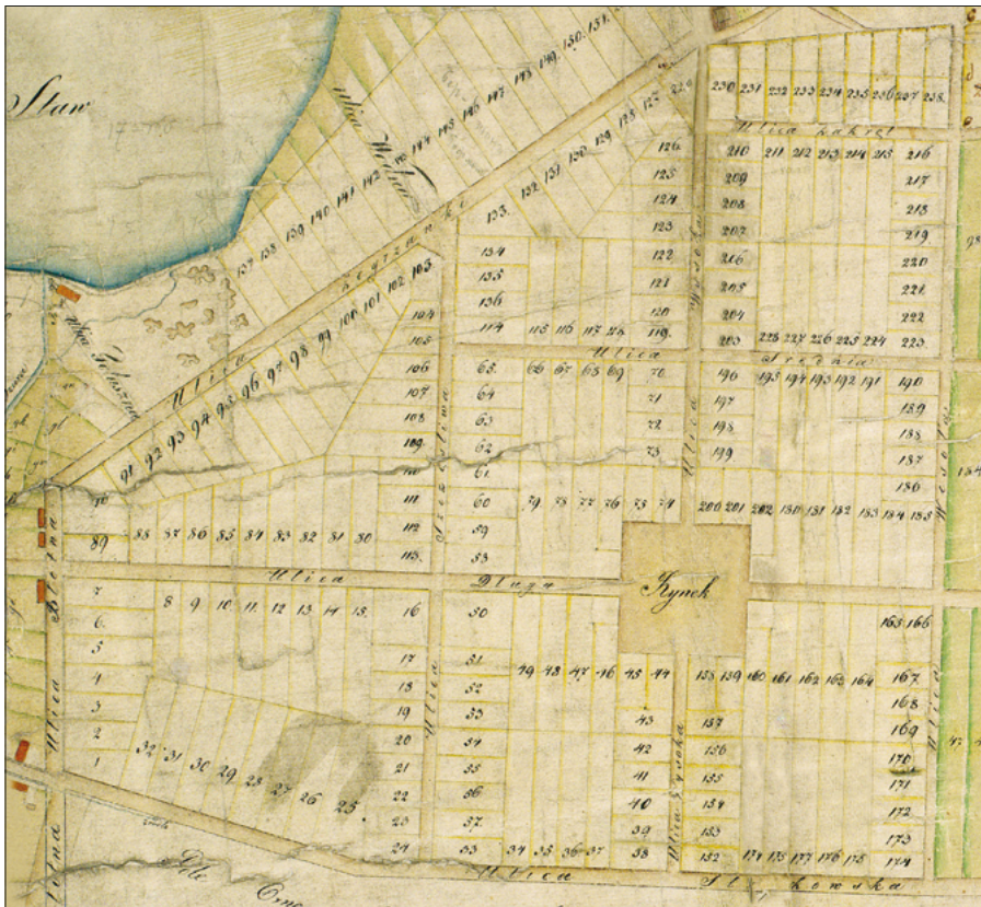
Fig. 1. A street plan of the New Town of Zgierz prepared by Jan Leszczyński in 1821 (source: State Archive in Łódź, ref. no. 99; graphic processing: K. Barucha).