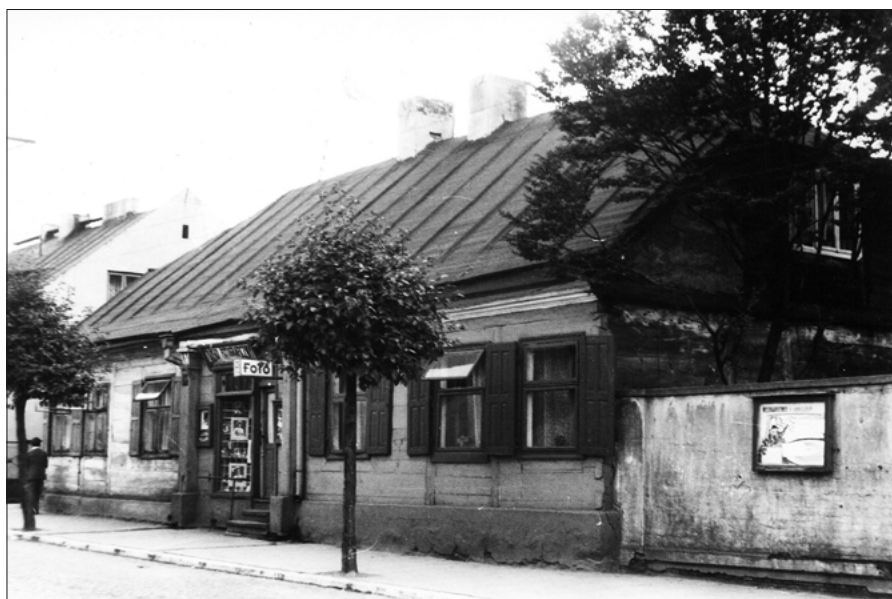
Fig. 11. The house at 38 Długa Street, 1965 (photograph by M. Pracuta, the collection of MMZ).