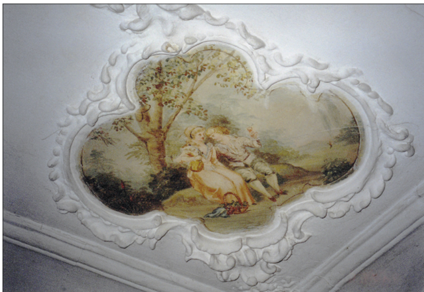
Fig. 15. A plafond from the second half of the 19 th century from the house at 16 Dąbrowskiego Street.