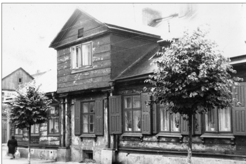
Fig. 8. Volute consoles under the window ledges of the house at 29 3 Maja Street, 1965 (photograph by M. Pracuta, the collection of the Museum of the City of Zgierz, hereinafter referred to as MMZ).