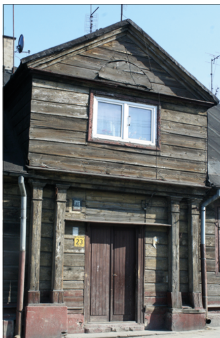
Fig. 3. Pilasters flanking the entrance and ‘supporting’ the mansard window of the house at 23 1 Maja Street.

(Fig. 3) or fluting (e.g. the house at 5 Kilińskiego Street). Below the cornices and on the mansard windows, there were openwork slats. Window and door joinery was decorative: double-layered doors, diamond-boarded (Fig. 4, Fig. 5), and frame-and-panel doors, with decorative hardware and woodcarving details, produced by local carpenters (Kopijka 2013: 41–87). Window ledges were supported on voluted consoles and there were boards (Fig. 6, Fig. 7) imitating bossage on the corners, while façade boards (Fig. 8) had profiled edges that imitated ashlars (Jasiński 2002: 54–55). Some of the features (imitation pilasters, columns with plinths and capitals, bossage) indicate that the architecture in question drew on classical masonry construction. It is worth mentioning that the houses of Zgierz craftsmen were to be ultimately masonry, and wood was only allowed as an exception. It was cheap and easy to process yet short-lived, and so temporary. Thus, the meticulous attention to the aesthetic and individual finishing of the buildings and the fact that so many of them have survived until today are all the more significant.