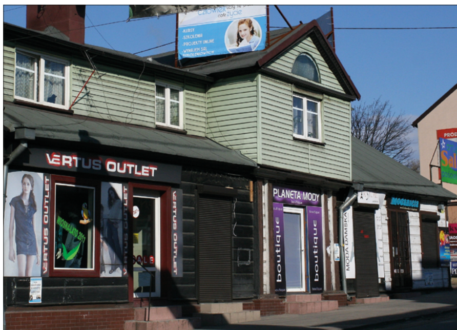
Fig. 10. The house at 15 Długa Street, today.