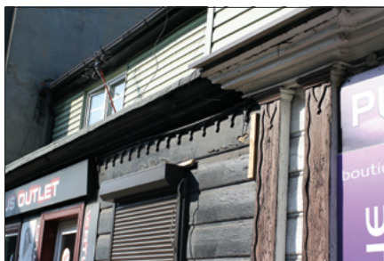
Fig. 5. Decorative boarding on the façade of the building at 15 Długa Street (source: the collection of the D.O.M. foundation).