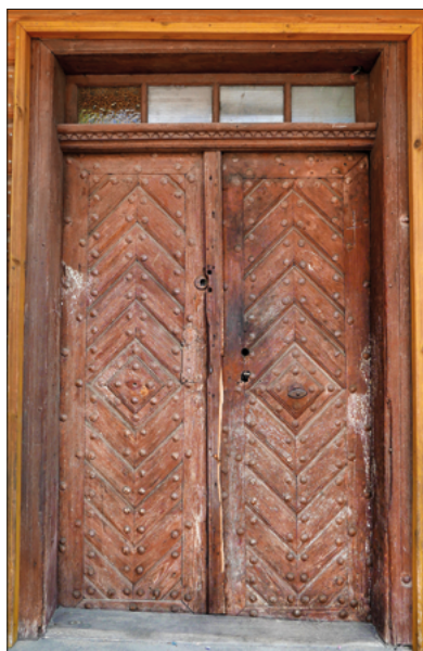
Fig. 7. A diamond-boarded door, at 29 Narutowicza Street.