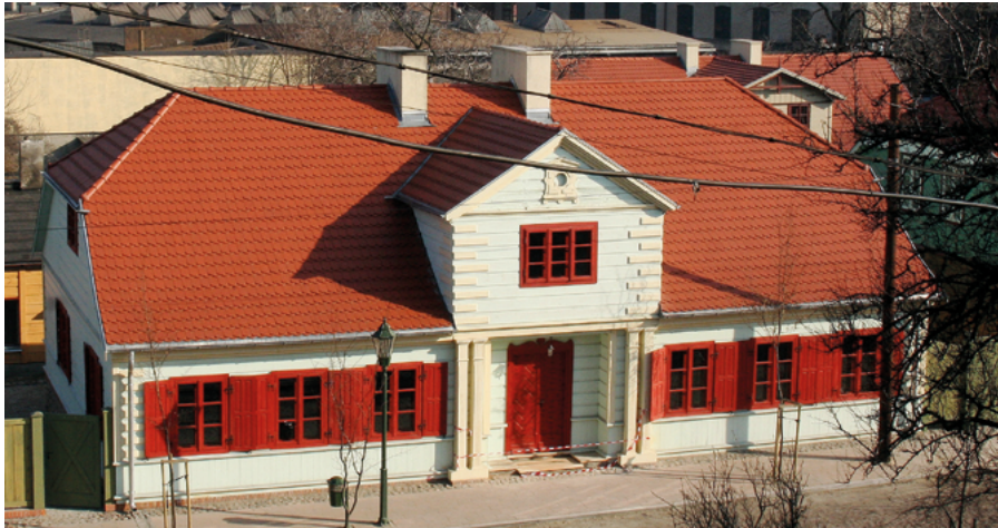
Fig. 2. The Weaver's House at 5 Narutowicza Street, as seen from Rembowskiego Street.

ridges parallel to the street. They had five or seven axes, with an entrance, frequently in a recess, and a through hallway along the main axis. In many cases, there was a mansard window along the axis above the main entrance, supported on decorative columns or pilasters flanking the entrance. The houses had walls of vertical-post log construction, joined in the corners with woodwork joints. They also had jerkinhead roofs, and the gable walls of the attic were framed walls with infill (the so-called Prussian wall) or without infill and boarded (Sitnicki, Heim, Bogusławski 2011: 14). The roofs were supposed to be tiled. Shingles were only allowed as a temporary solution and people had to paint them red so that they looked like tiles.