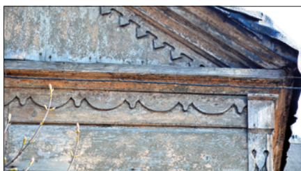
Fig. 4. Decorative slats on the façade of the building at 16 Dąbrowskiego Street.