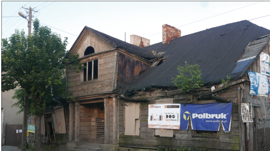
Fig. 14. The house at 16 Dąbrowskiego Street in 2019.

Some effort is required not only in the area covered by the previous project, but the whole New Town as an urban arrangement and its individual objects.