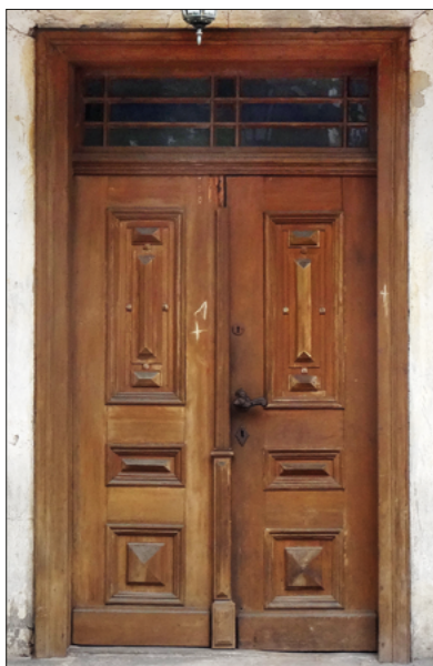
Fig. 6. A frame-and-panel door at 7 Narutowicza Street.