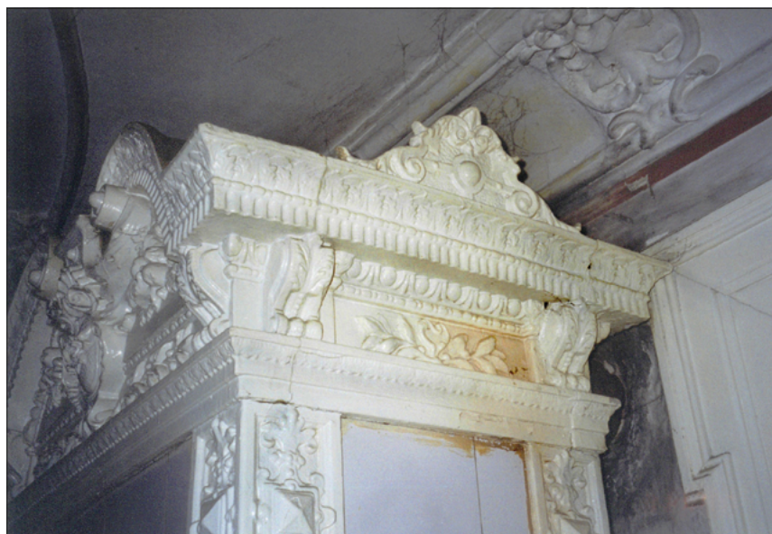
Fig. 16. A no longer existing stove from the second half of the 19 th century from the house at 16 Dąbrowskiego Street.