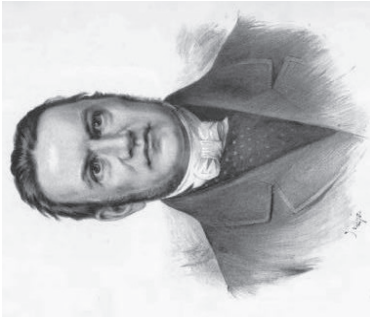
Fig. 2. Paweł Szafranik (1795–1861)