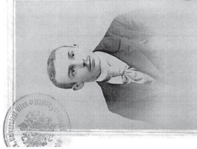
Fig. 7. Karol Hadachek (1873–1914) at the time of his studies in Vienna.