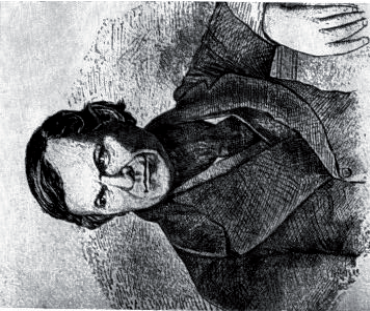
Fig. 1. Jan Wagilewicz (1811–1866) (Source: Maternicki, Zaszkilniak 2007)