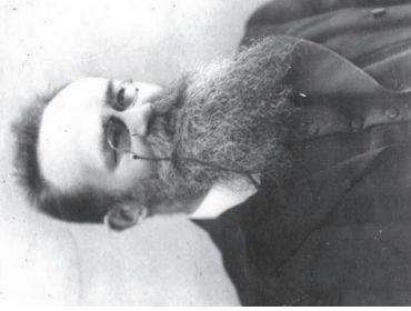
Fig. 4. Michal Hruszewski (1866–1934)