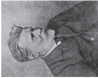
Fig. 6. Fedir Wowk (1847–1918)