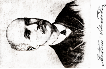
Fig. 3. Antoni Schneider (1825–1880)