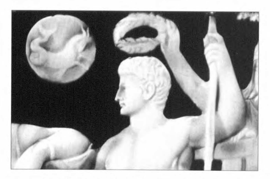
Fig. 6. Fragment of the Gemma Augustea with the Capricorn (After: Bianchi-Bandinelli 1969, fig. 211)