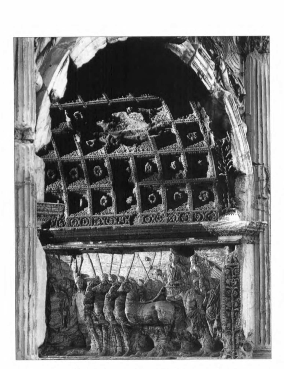
Fig. 3. The northern relief of the passage in the Arch of Titus (After: Busagli 1999, p. 95)