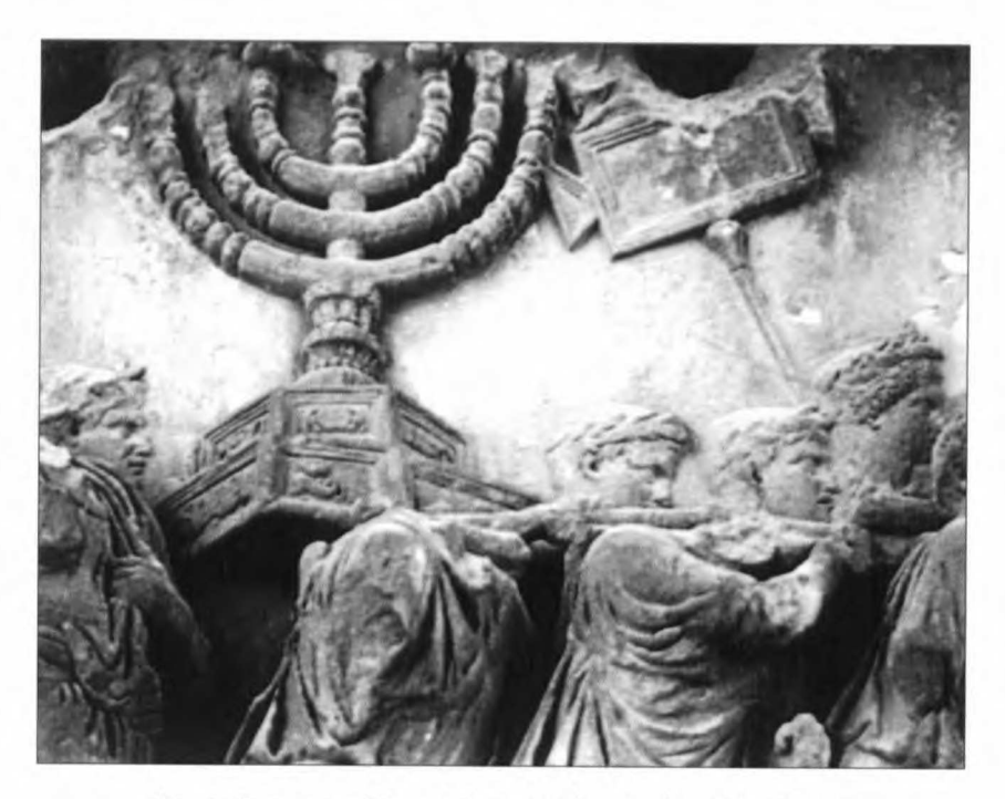
Fig. 4. Fragment of the southern relief from the Arch of Titus (After: Cornell, Matthews 1991, p. 80)