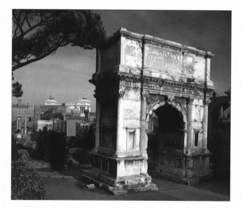
Fig. 1. The Arch of Titus seen from the eastern side (After: Busagli 1999, p. 94)