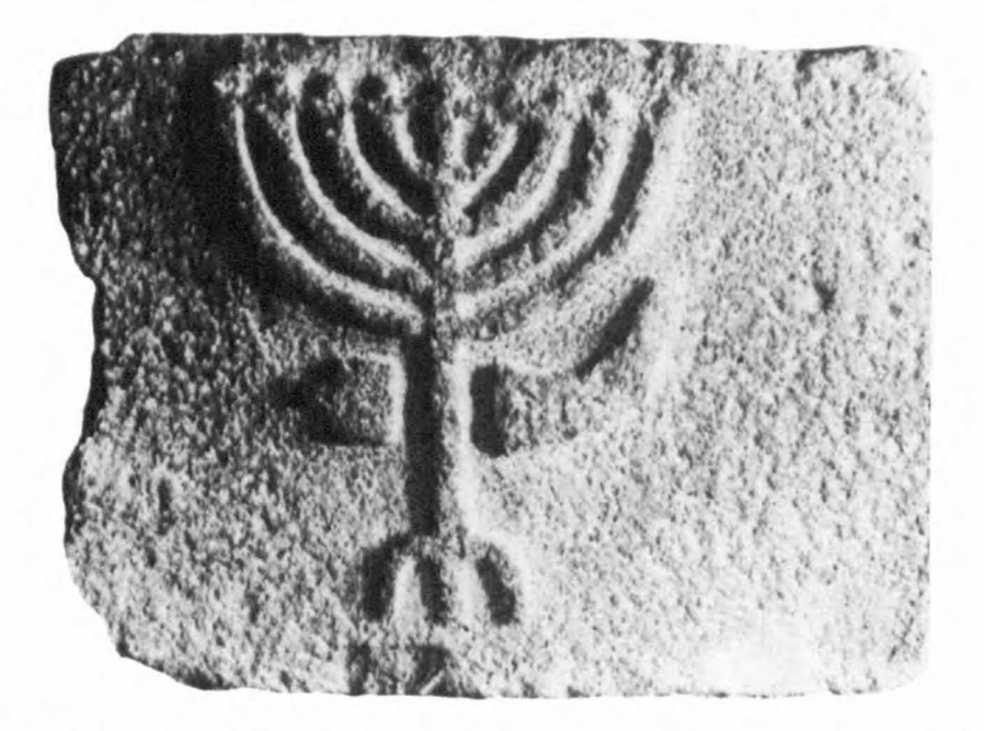
Fig. 7. Relief with a menorah from the synagogue in Jehudiye (Golan). III-VI century A.D. (After: Ma'oz 1993, p. 534-546)