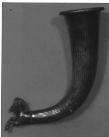
5. Rhyton from Bashova mogila