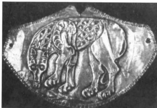
3. Gold pectoral from Bashova mogila