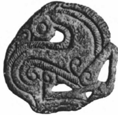
2. Appliqué from Brezovo