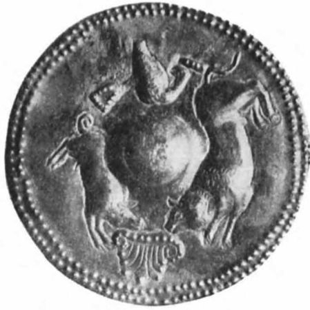
6. Silver appliqué from Panagirishte