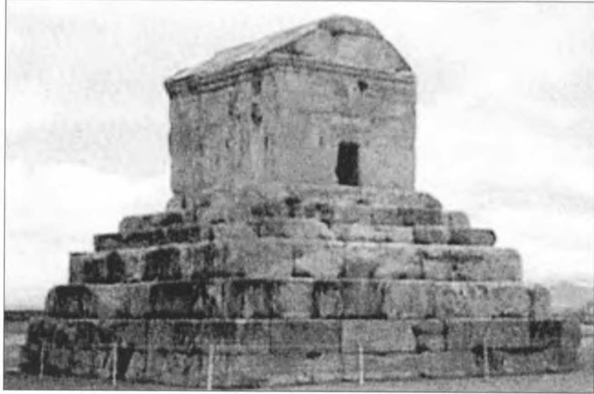
9. The tomb of Cyrus the Great in Pasargadai