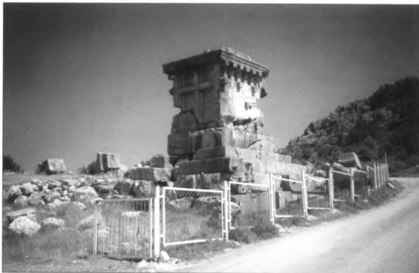
12. Xanthos – Free-standing house tomb beside the Roman agora