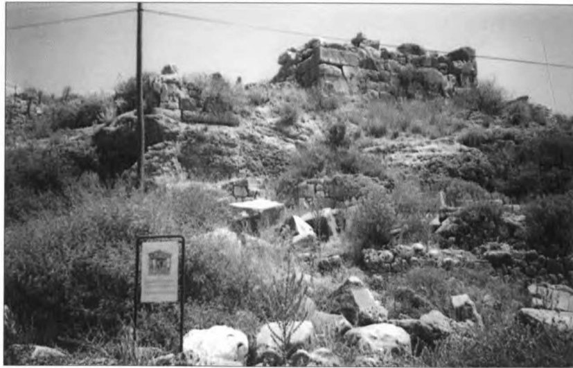
10. Xanthos, the place where once stood the Nereid Monument