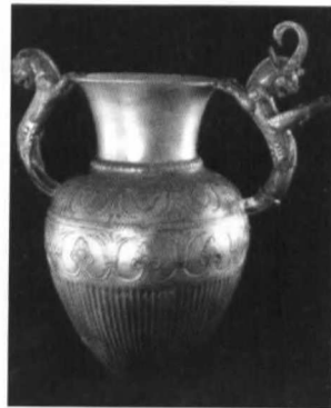
4. Silver vase from Kukuva mogila