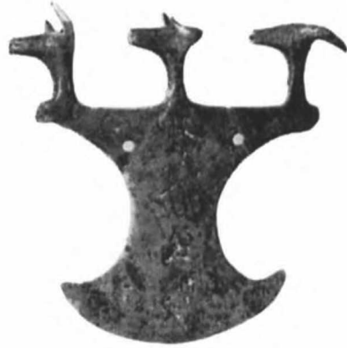
1. Cult Axe from Teteven