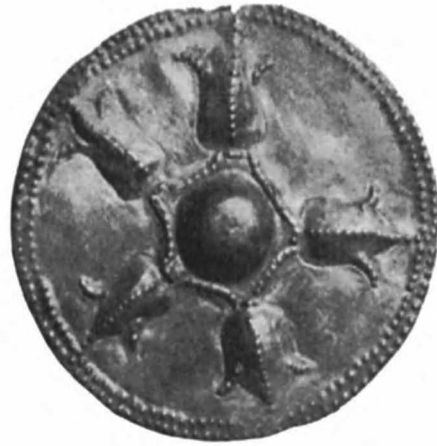
7. Silver appliqué from Panagirishte