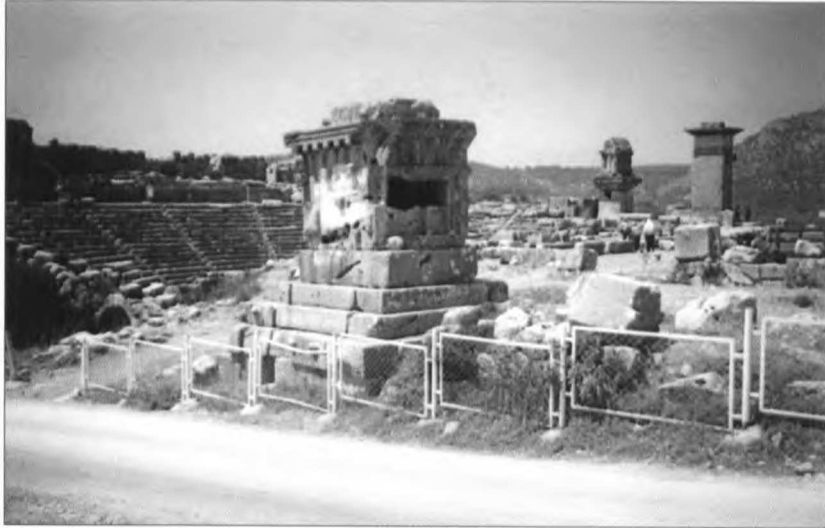
11. Xanthos – Free-standing house tomb beside the Roman agora