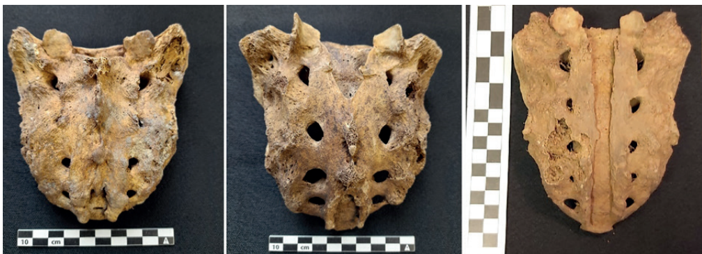
Fig. 2. Normal sacral bone (a), sacrum with partial (b) and complete (c) spina bifida occulta

In paleoanthropological studies we used differing classification systems for SBO assessment (see Discussion) what may account for variability in reported frequencies. Therefore, the present study was based on the medical assumption stating that SBO at the level of the vertebrae S3, S4, S5 is treated as morphological variability within normal limits (Kumar, Tubbs 2011); the cleft observed at the height of the above-mentioned vertebrae was treated here as no cleft (see Abera et al. 2021; Kim et al. 2018). This allows for the development of methodological standards for historical populations analyses, which not only are necessary for making inter-populations comparisons, but also allow for the comparison of the obtained results to medical data.